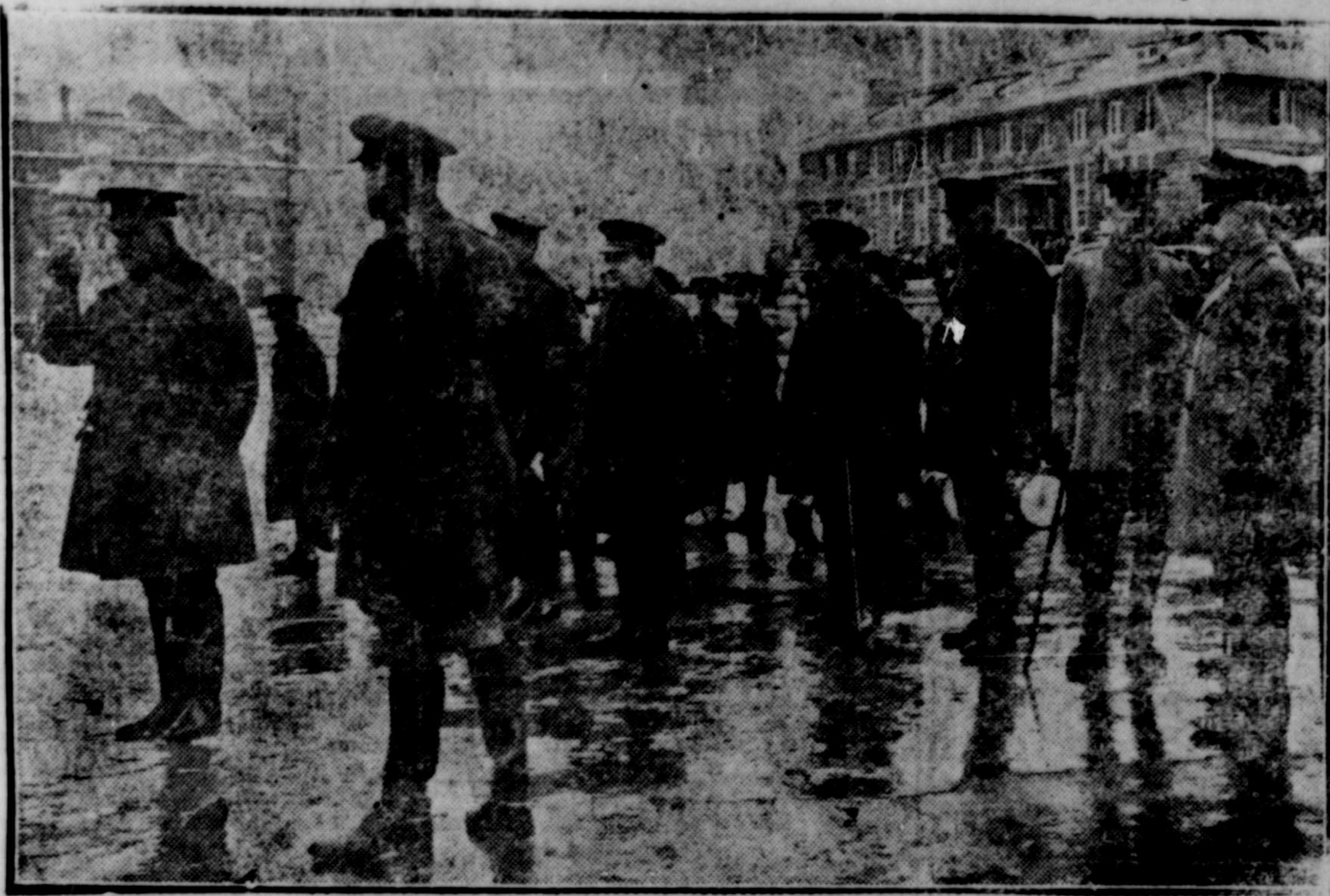
SIR SAM HUGHES' LAST APPEARANCE AS MINISTER OF MILITIA. —Before taking off his Lieutenant-General's uniform, Sir Sam Hughes presented the colors to the 207th Battalion in Ottawa. This was the last public official act of the ex-Minister of Militia.