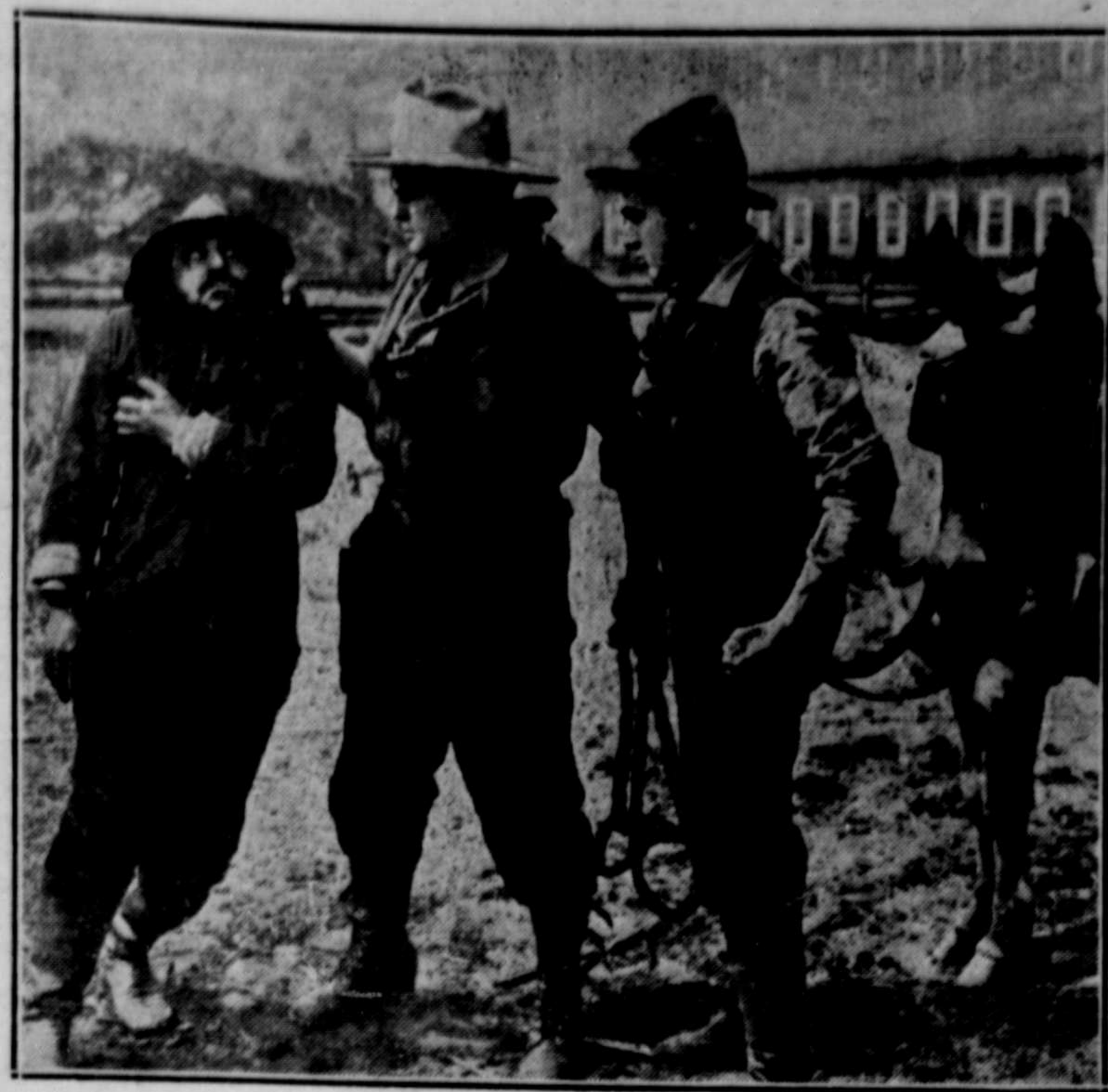
Scene from "The Plunderer," the Fox-feature at the Westholme Theatre tonight.