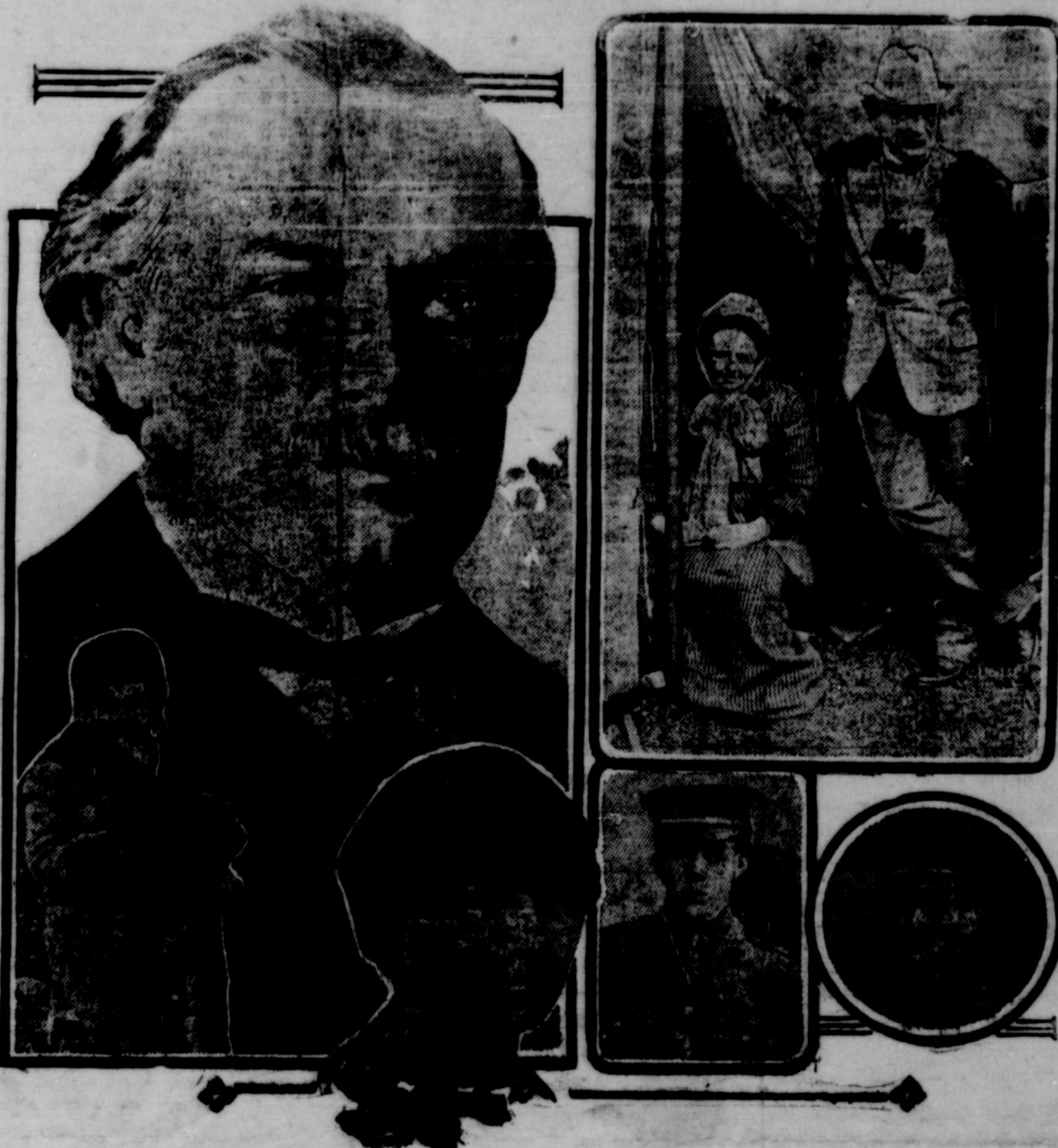
GREAT BRITAIN'S NEW PRIME MINISTER AND THE MEMBERS OF HIS FAMILY

The City is about to publish a new Directory. Subscribers desiring change of address or any other alteration, please notify the Supt. of Utilities in writing, no later than Dec. 20th, 1916. 295.