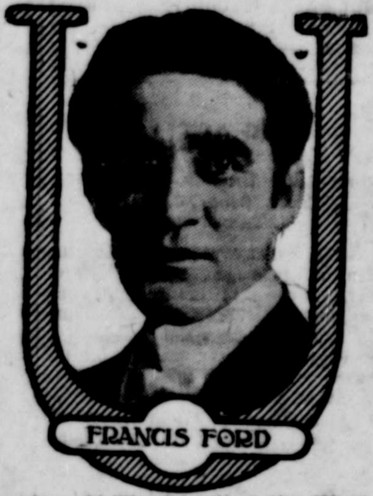
In "Peg-O' The Ring" at the Westholme Theatre tonight.