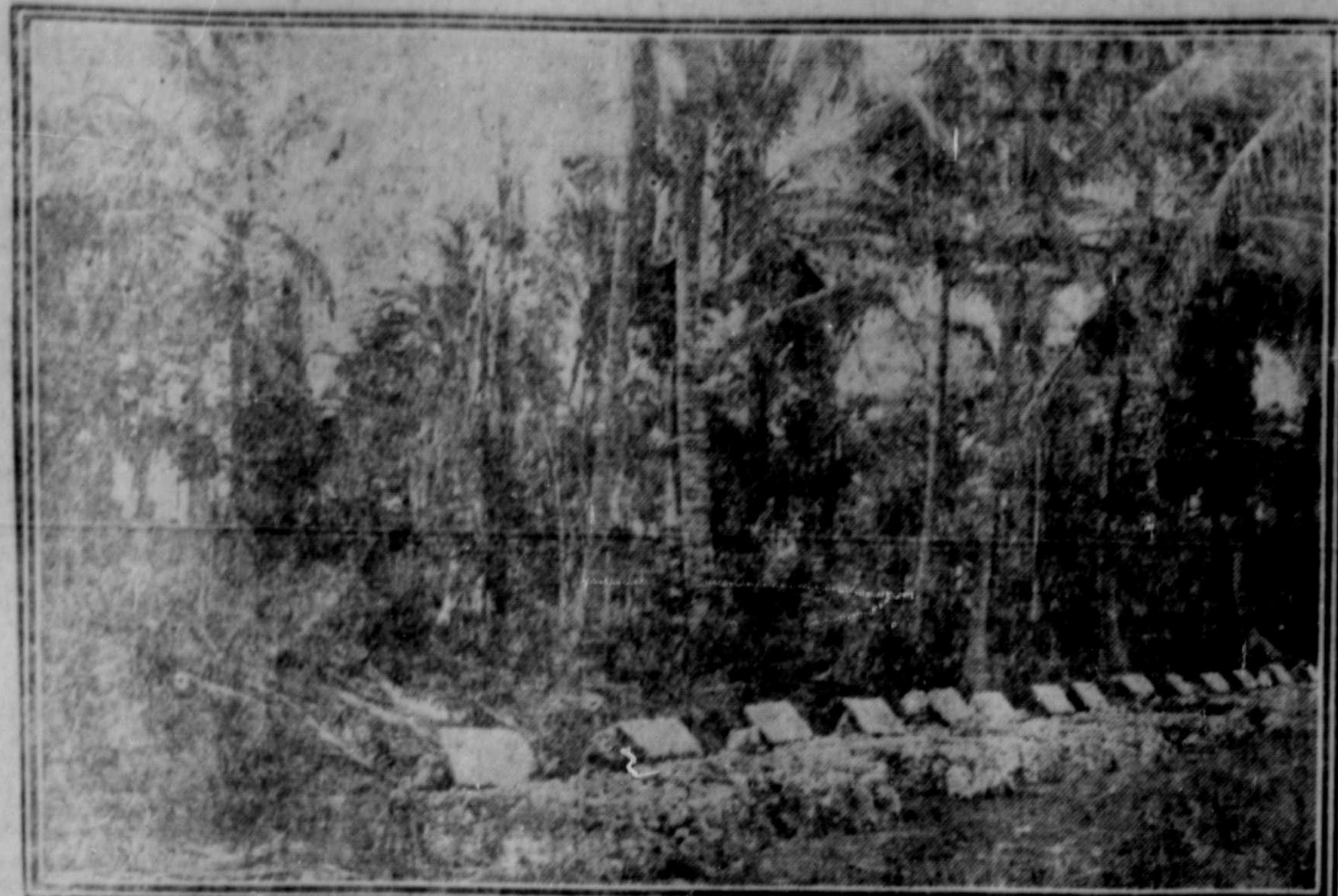
WHERE GERMAN KOPEK AND GERMAN SOLDIERS LIE BURIED IN EAST AFRICA. —This photograph shows the nature of the country recently conquered by Lieut.-General Smuts and his British South African forces. The long line of headstones are on graves of German officers who lost their lives in defence of this ill-fated colony.

After the bath with BABY'S OWN SOAP the skin is smooth, comfortable, and exhales the aroma of freshly cut flowers. Freedom from skin troubles, explains in some measure the refreshing sleep which "Baby's Own Soap" babies enjoy. Especially for nursery use insist on "Baby's Own". ALBERT SOAPS Limited, Manufacturers, - MONTREAL. 14-13