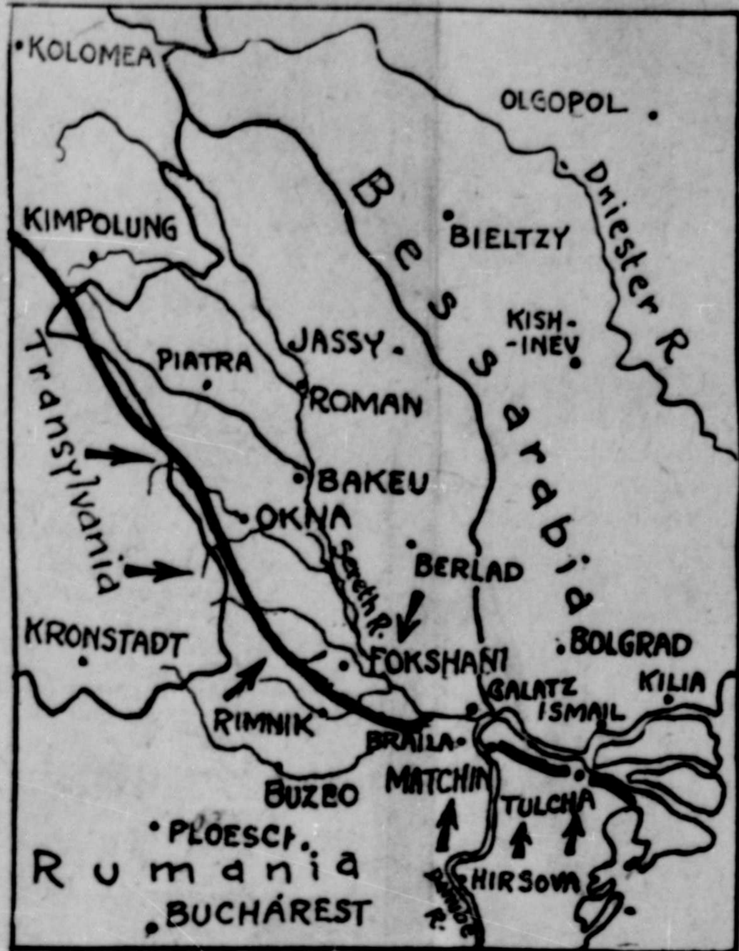
THE BATTLEFRONT IN RUMANIA

NEW WELLINGTON COAL. phone 116. We have just re- ceived a shipment of 500 tons Lump Coal. We are prepared to put in your winter's coal for you.