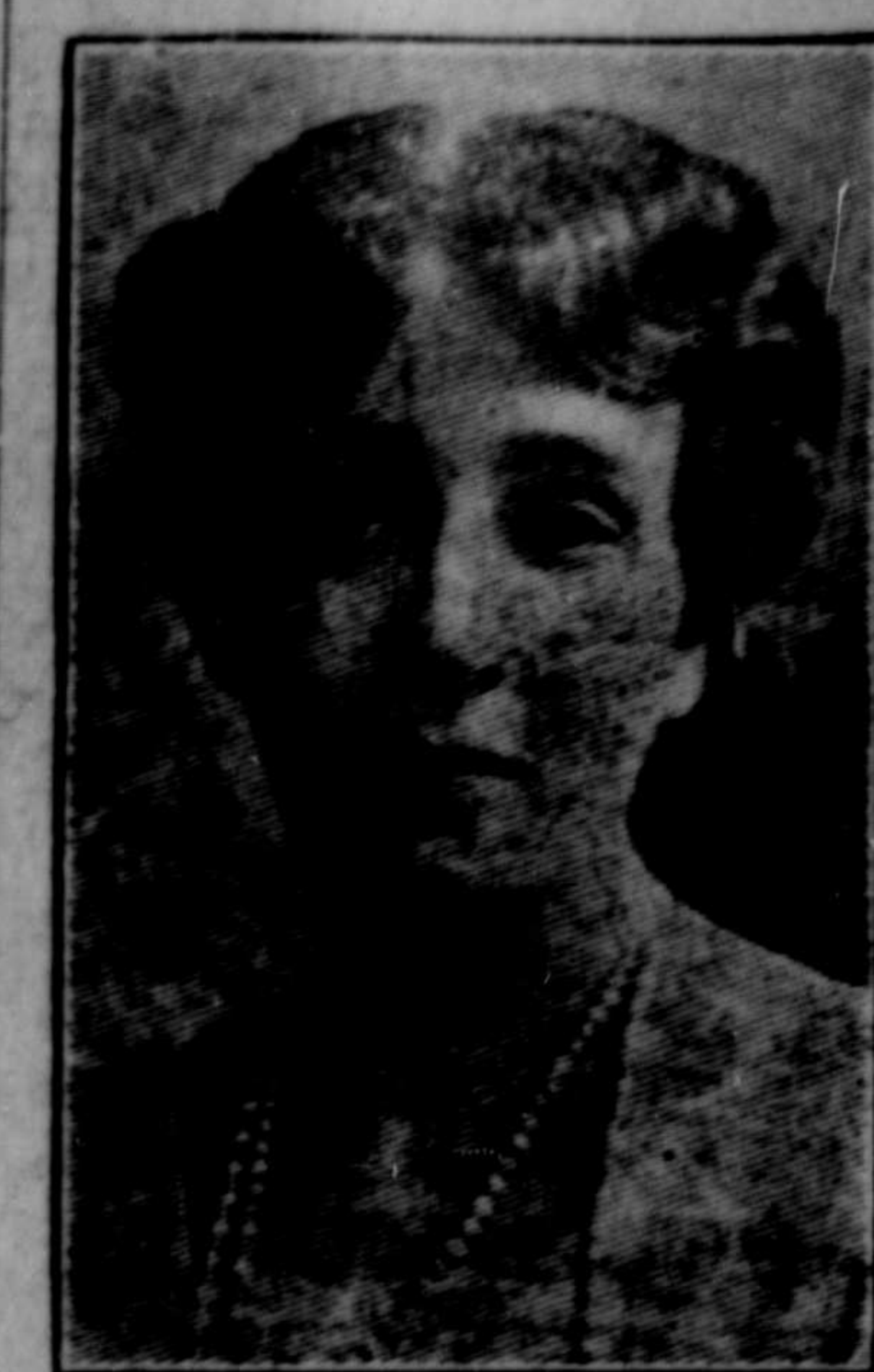
LADY BEATTY, wife of Sir David Beatty, K. C. B., M. V. O., Admiral of the Fleet and the commander who will carry out Sir John Jellicoe's orders for the blockade of Heligoland Bight. Lady Beatty has been particularly active, since the outbreak of the war, in hospital and Red Cross work.

"Creme de Menthe" was not an infringement of the drinking law, but a "tank." It was the Canadians' own, peculiar tank. It went strolling over the field, with its awful and ludicrous solemnity, before the advance, tearing up wire, sitting across trenches and sweeping them clean on either side with machine gun fire, flattening out machine gun posts and the like. And in the course of its perambulations it saw the impregnable sugar refinery of Courcellette. It walked up to that impregnable spot. It leaned against