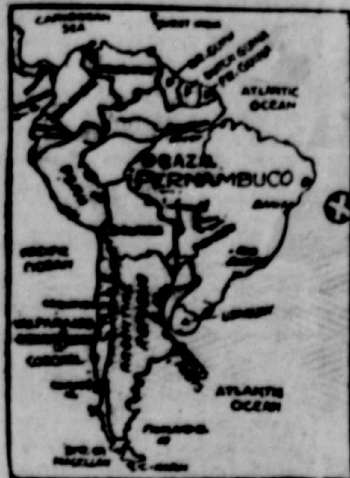
Where The German Raider Operated.—The cross shows the region of operation of the latest German raider off the coast of South America.