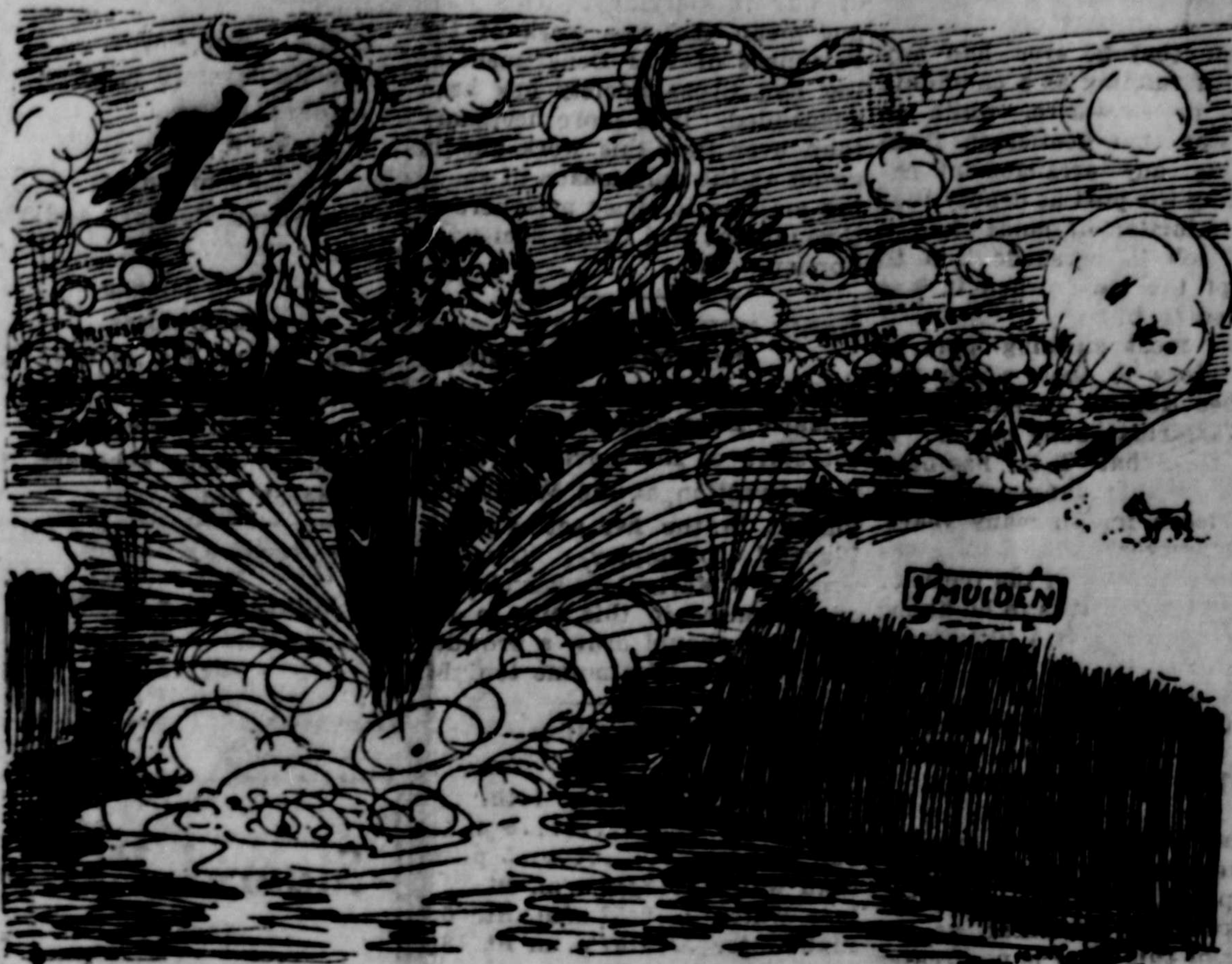
HE NEEDS IT NOW.—Admiral Von Turnips: "Hey, President Wilson, hurry up mit dot Freedom of der Seas Order."

The Patriotic Fund is your chance to get behind the boys at the front.