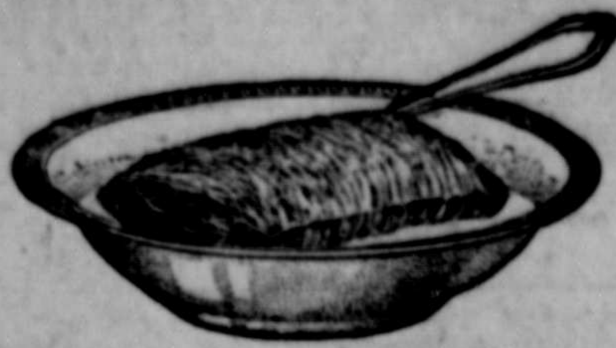
Made in Canada.

It may be the forerunner of bronchitis or a bad cold. It is nature's warning that your body is in a receptive condition for germs. The way to fortify yourself against cold is to increase warmth and vitality by eating Shredded Wheat , a food that builds healthy muscle and red blood. For breakfast with milk or cream, or any meal with fresh fruits.