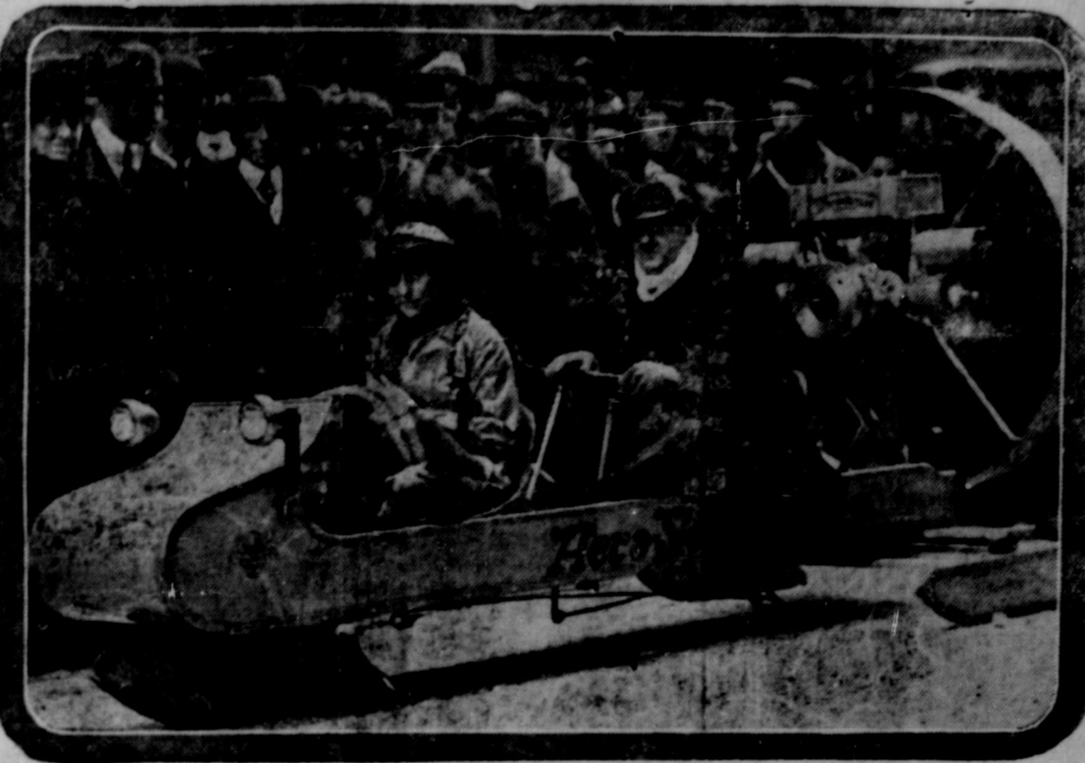
AERO-SLEDDING IN THE SECRETS OF NEW YORK. —Annette Kellerman and a companion seeing the city in a new kind of conveyance. This contrivance runs on either frozen river or snowy pavement. There are several types of the aero-sled now in operation in the United States.

Could you fight in the trenches if your family were in need at home? The Patriotic Fund sees that the loved ones are fed, if