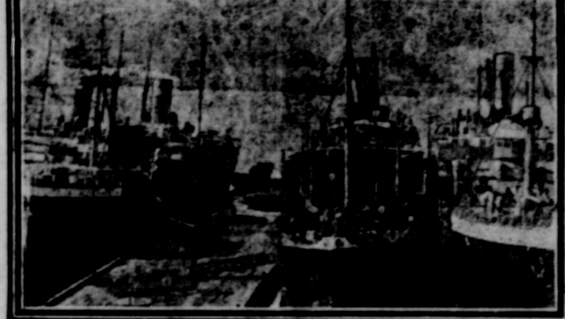
German and Austrian Ships in New York Harbor Would Make Rich Prizes. —The above ships in New York and Brooklyn harbors are only a few of the hundred German and Austrian liners and freight carriers lying interned in United States ports, from the gigantic ten million dollar Vaterland, of fifty-four thousand tons, down to the Neptune of 197 tons in San Francisco. Their total tonnage is over half a million and their value over thirty million dollars.