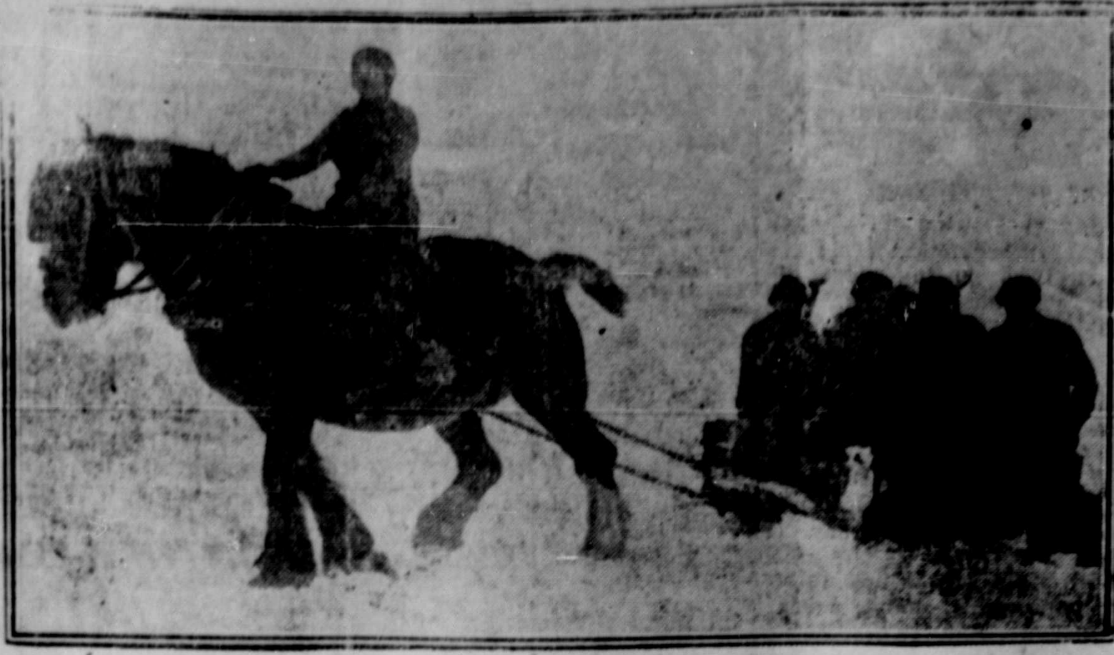
GIRL WORKERS RIDE OLD DOBBIN NOW. —The sleigh is more generally in use this year in many parts of England than ever before. The farm help in the photo are on their way home from a hard day's work.