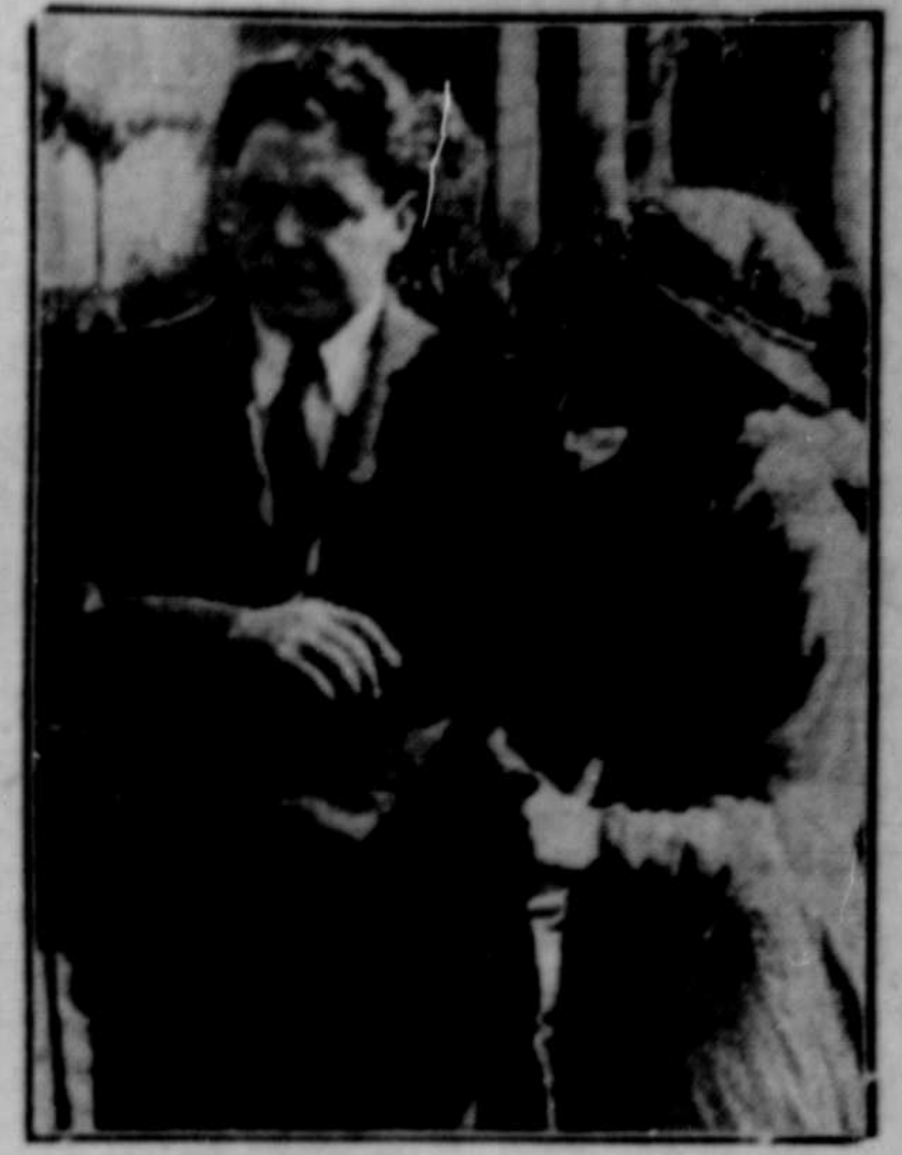
At the Westholme tonight.

The march of the force under Sir Percy Sykes from Bunder Abbas to Isfahan, and finally to Teheran, a distance of 1,000 miles, had not been mentioned hitherto in this country. The object of General Sykes was to organize the southern Persia forces into a military gendarmerie under the Persian government, but off-