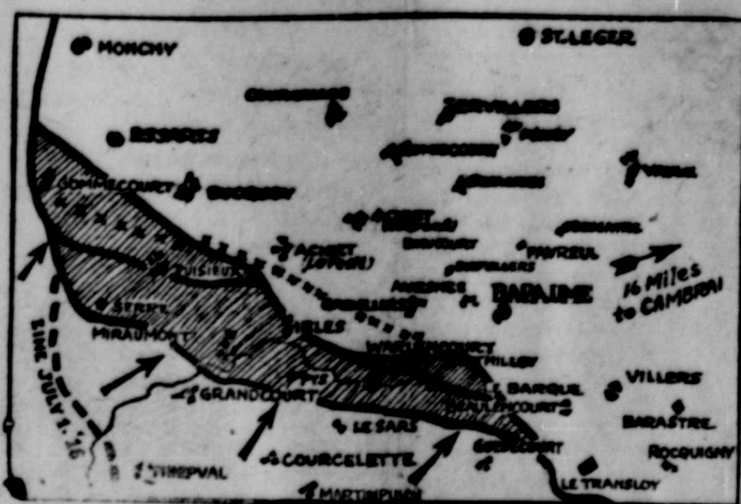
BRITISH ADVANCE DURING THE PAST WEEK. The shaded line represents the British Gains.

New York, March 12.—According to reports, Sir Sam Hughes, as a representative of the British army, came to New York to confer with the United States army officers. On being interviewed, Sir Sam insisted that he came on personal business, but finally admitted that there had been a conference.