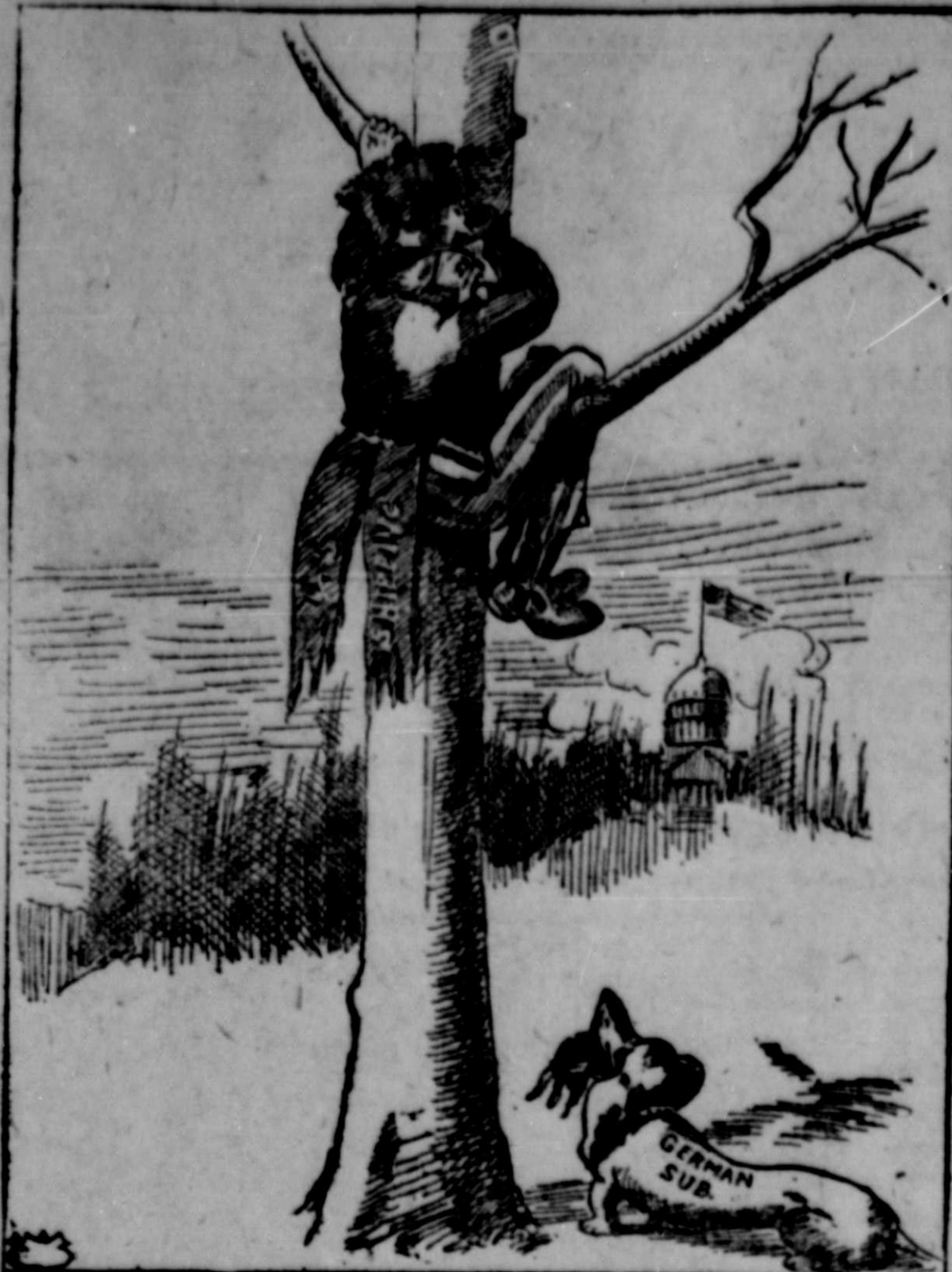
UP A TREE. —Uncle Sam: "Just wait until he bites me, and then see me jump on him with both feet."—Cartoon by Shields in the Toronto Telegram.