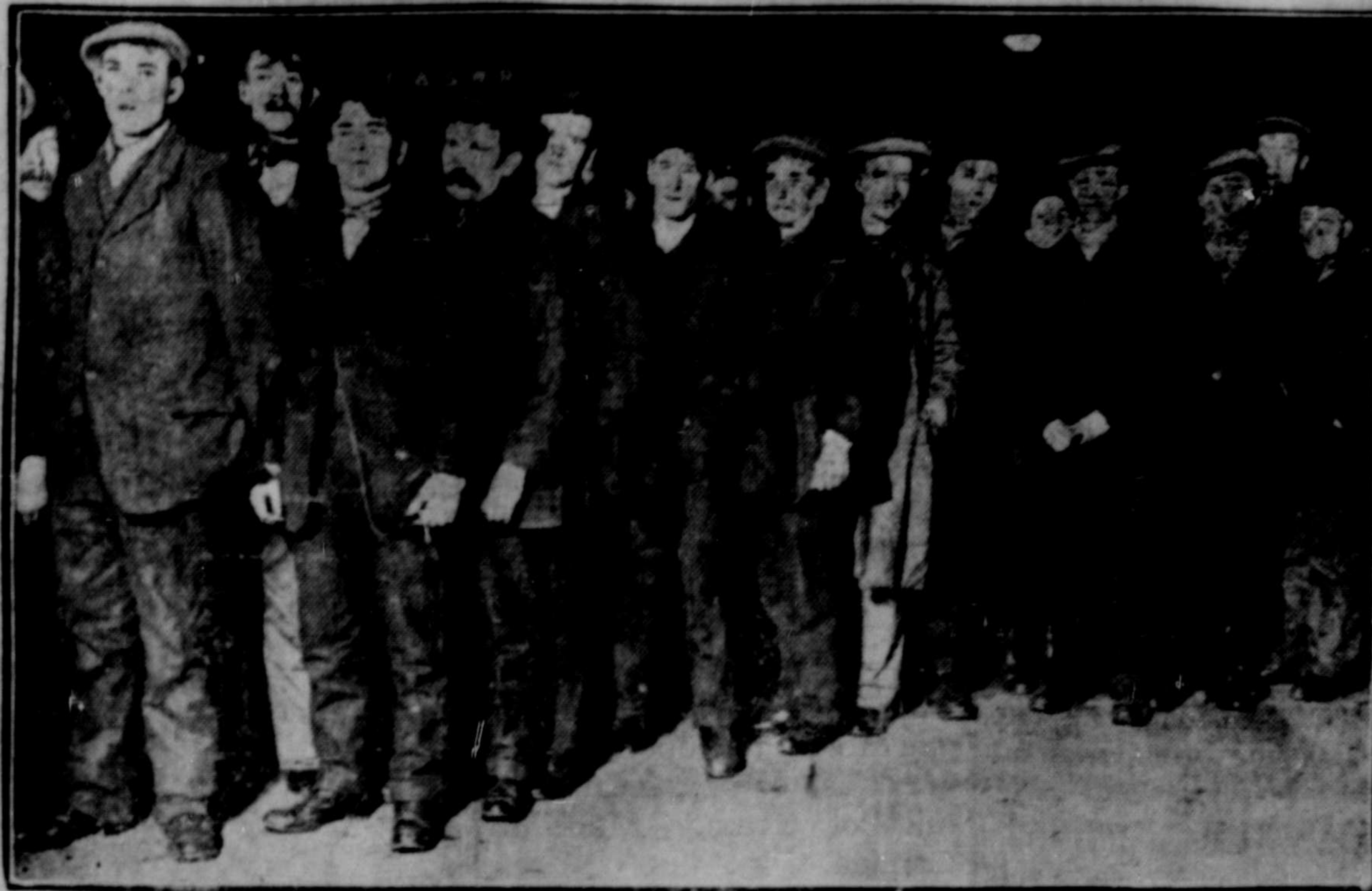
STRANDED SURVIVORS OF THE TORPEDOED "CALIFORNIA."—The photo shows the helpless victims of Hun savagery as they arrived at Glasgow from Holyhead. It was a sad homecoming for the British born, who were returning to their native land in most cases after many years absence.

Complete line of spring goods at Goldbloom's.