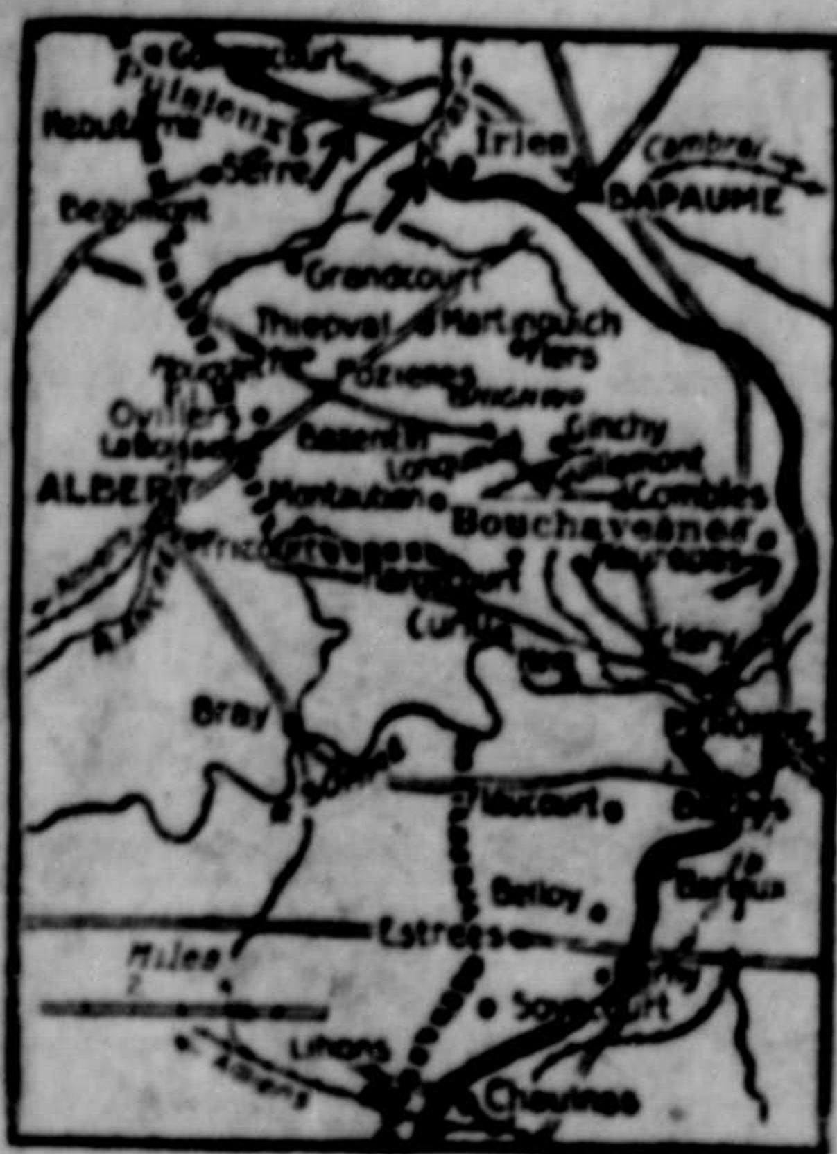
MORE BRITISH GAINS.

The arrows show the direction of the recent advances.