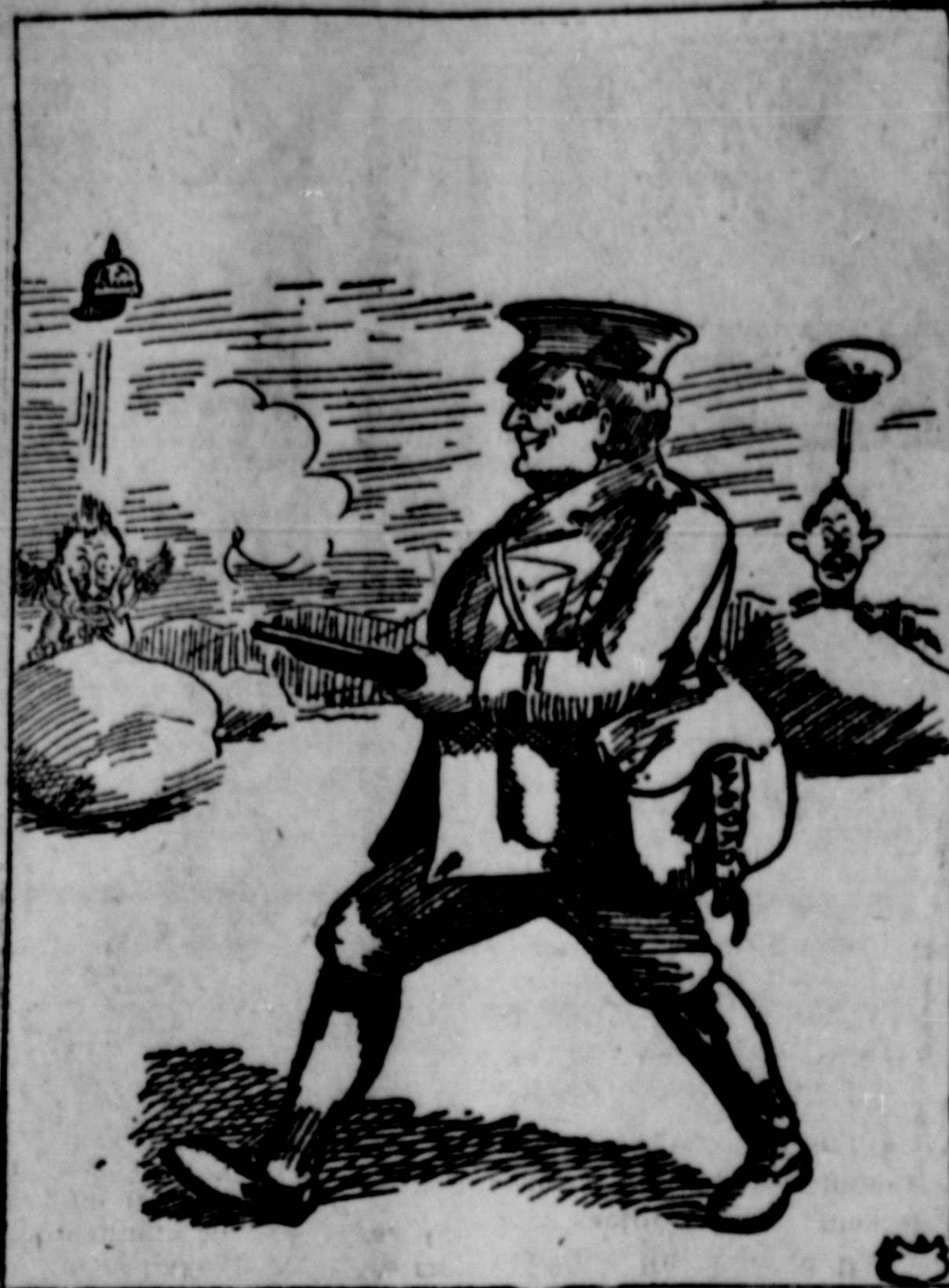
A MIGHTY HUNTER IN NIMNOD'S OWN COUNTRY Crown Prince: "Next thing John Bull will Bag—dad."

They make Gasoline Tanks, Galley Pipes, Smoke Stacks, Chimney Tops, and all the work that is usually done in the OLD FASHIONED TIN SHOP, WITH ALL THE LATEST DOWN-TO-DATE WORK SPECIALIZED, such as SKYLIGHTS, CORNICES, Etc. Everything in the line for Mill, Mine or Factory. Stoves put up and connected to boiler. Roofing in all kinds of material. Repairing of all kinds. PRICES RIGHT, SERVICE FIRST-CLASS. A SATISFIED CUSTOMER IS OUR AIM. PHONE 340. P. O. BOX 467. Factory and Office 222 2nd Avenue and 2nd Street, close to Cow Bay and Government Wharf DR. KERSH BUILDING.