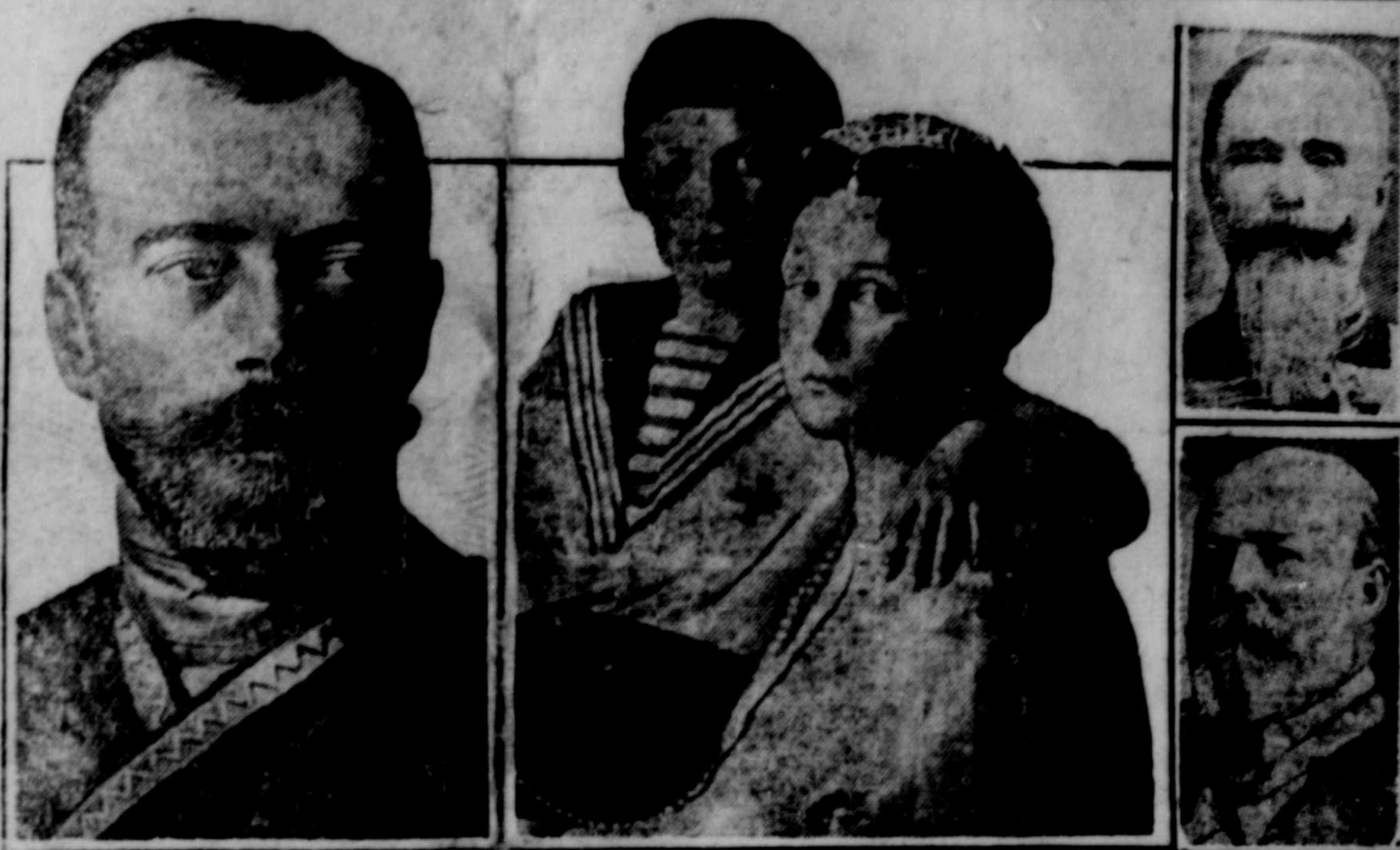
CZAR NICHOLAS AND THE DARK FORCES WHICH COST HIM HIS THRONE.—The lady in the picture was the Czarina, a former German Princess, accused of forwarding German influence and aiding the arch plotter, the Monk Rasputin. With her is her son, the Czaritch, who would have succeeded to the throne. It has been frequently reported that the lad is weakly, in a physical and mental way. The other figures are former Premier Sturmer and Prince Golitzen, reactionaries and alleged pro-German, who are both now in jail.

Although they will be recruited by the Canadian authorities, the Serbians will not become members of the Canadian expeditionary force. This is but another service which the Empire is rendering to its Allies, and, on leaving Canada, they will be sent direct to the Balkans to take their place in the firing line with their fellow-countrymen.