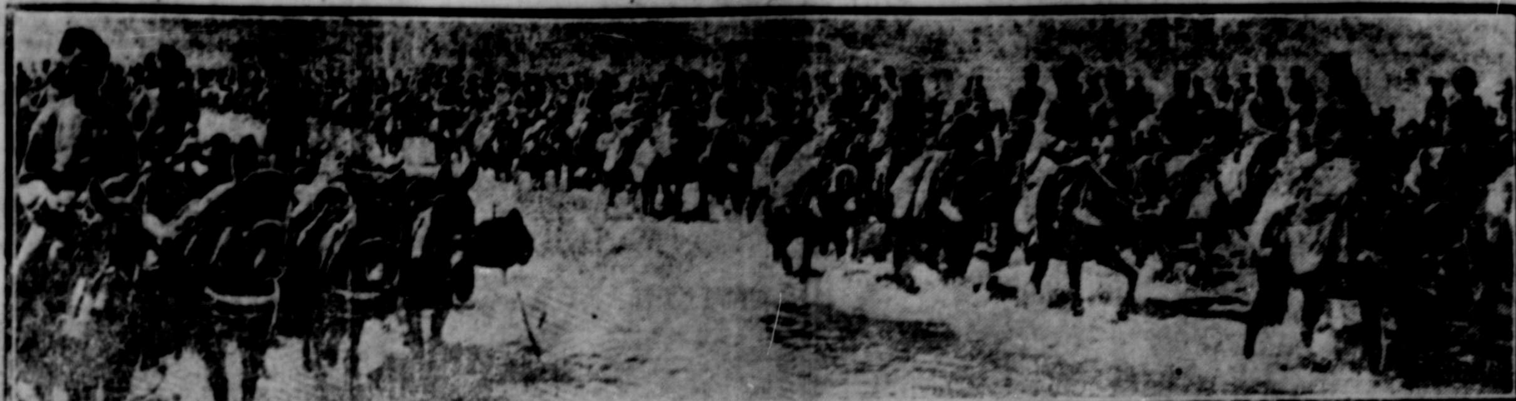
THE ARMY THAT CONQUERED BAGHDAD AND IS STILL CHASING THE TURKS. —This picture shows a portion of the army of General Maude in his victorious Mesopotamian campaign. His army is largely made up of Indian troops like these shown in the picture. The meagre dispatches received from the East pay a high tribute to the valor of these troops, which are now many miles beyond Baghdad.

Wistaria NOW DOING BUSINESS Branch La Casse Bakery— Tickets Good. Confectionery and Pastry Tea Room Exquisite Service Phone Green 127.