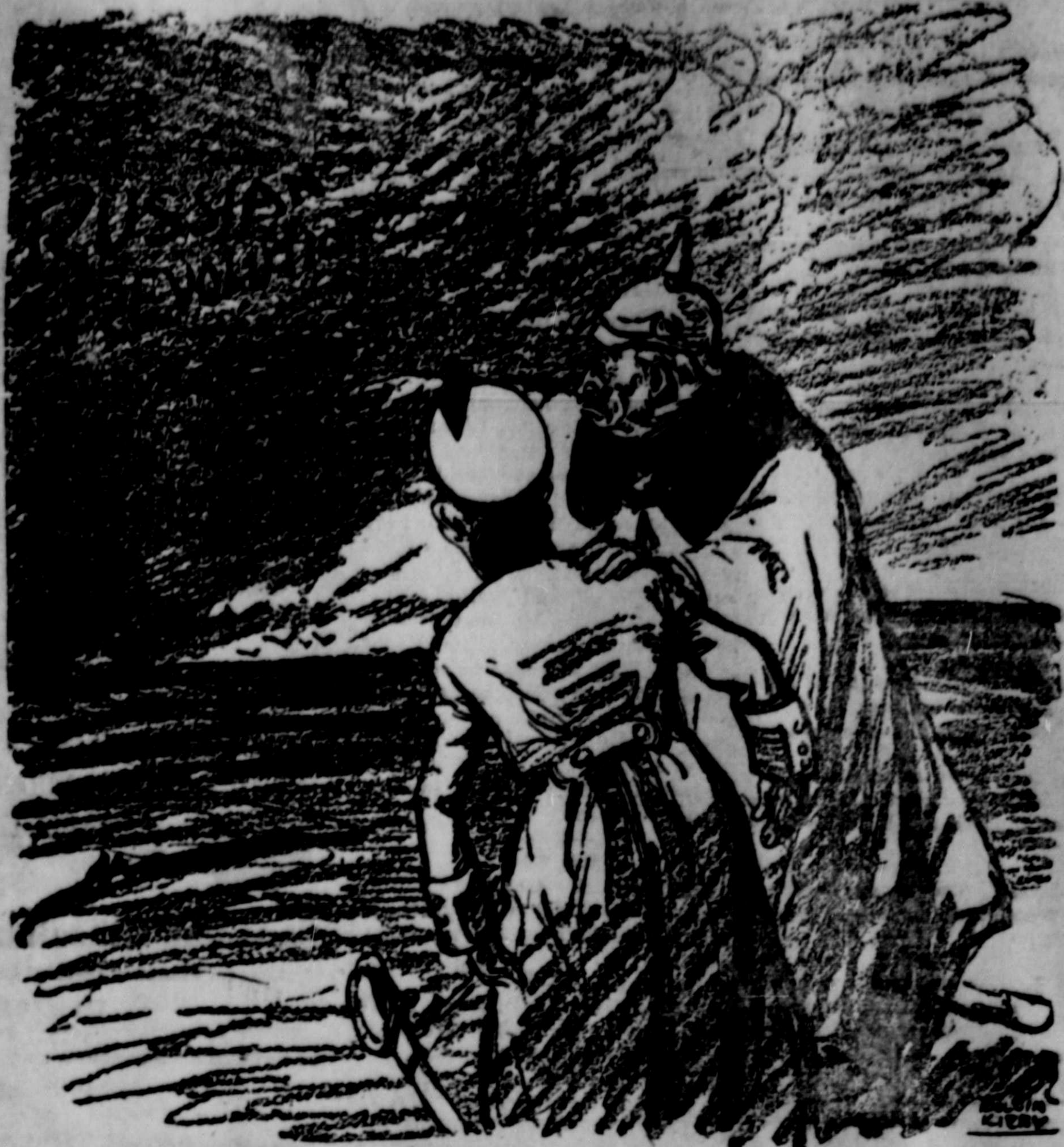
THE PORTENT.—Cartoon from the New York World.