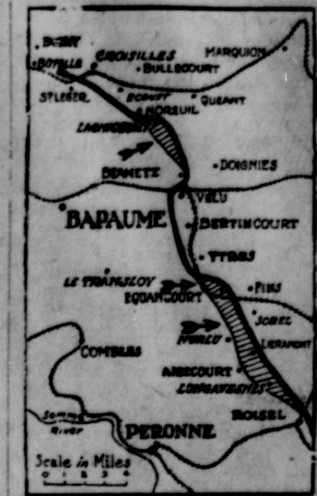
THE BRITISH GAINS IN FRANCE. This map is brought right up to date.

The favorite household Coal is Ladysmith Wellington. Phone 15, Prince Rupert Coal Co. ll.