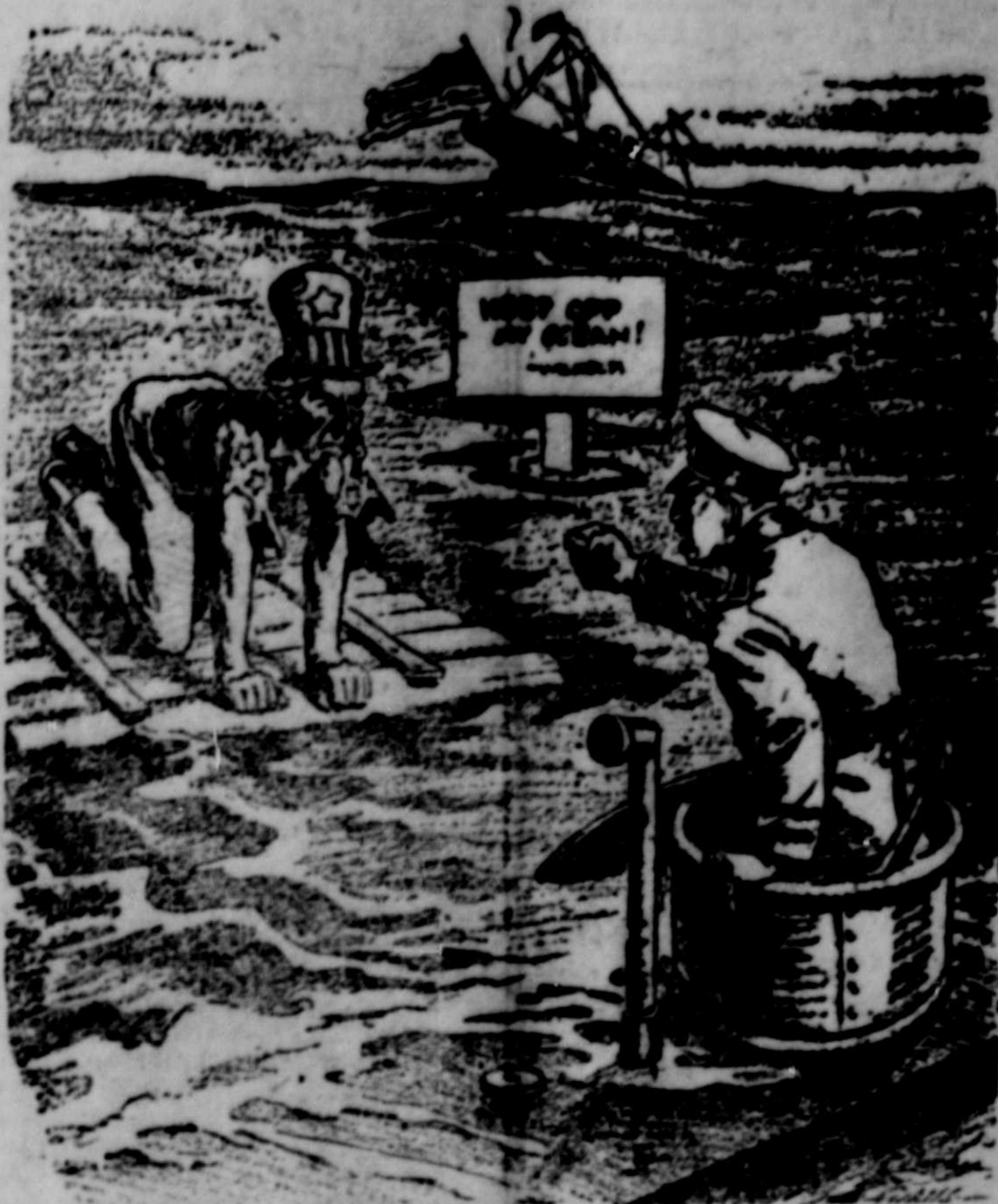
UNCLE SAM COMMITS AN OVERT ACT.—Wilhelm: "Lieber Gott! You ran right in my way." Cartoon from Baltimore American

At the Westholme tonight is to be screened an all-star cast in "The Salamander." This is a Paramount production and is one of great merit. The heroine of the play, the "Salamander," who comes through the fire without being scorched, is a great character and the whole play is one of great interest. There is also a Topical Budget, depicting the latest events of recent days, and the orchestral programme has been chosen with great care and is of a high order.