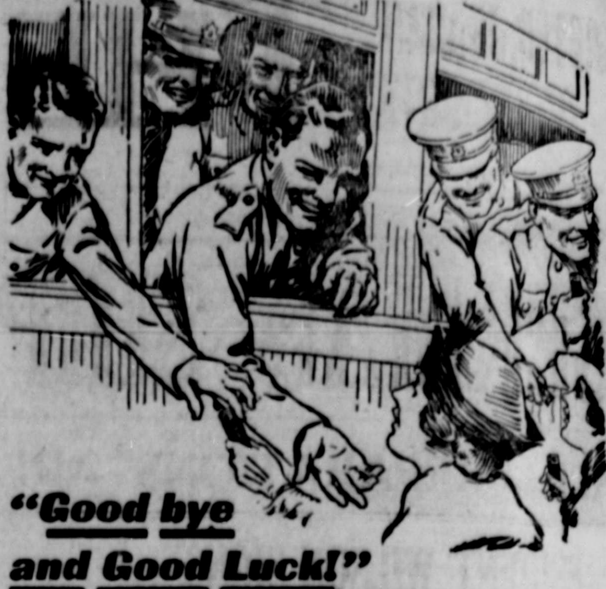
"Good bye and Good Luck!"

Commencing at a post planted one mile south of the southeast corner of C. L. 9967; thence west 80 chains, thence north 80 chains, thence east 80 chains, thence south 80 chains to point of commencement.