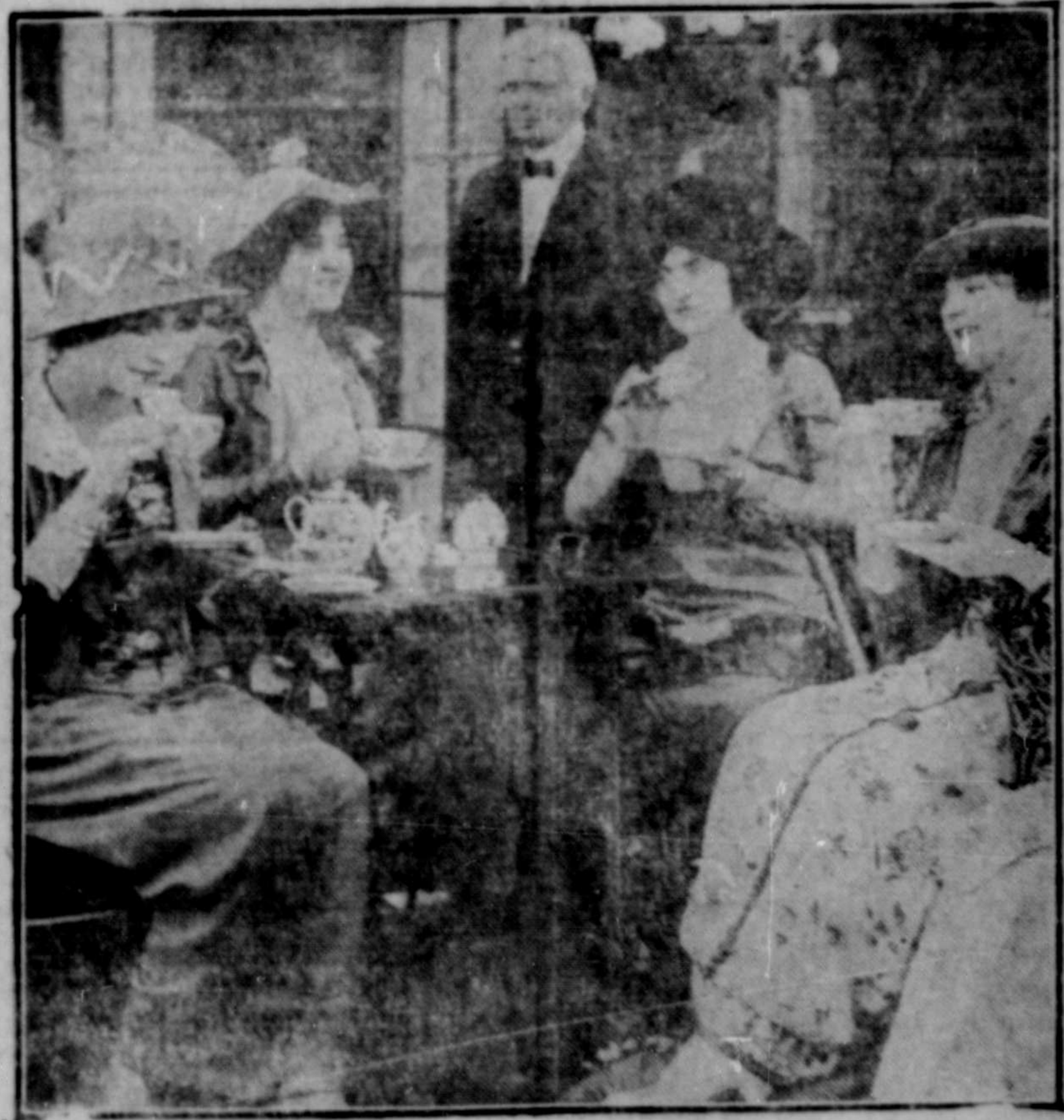
Scene from "Madame X" being shown at the Westholme Theatre tonight.