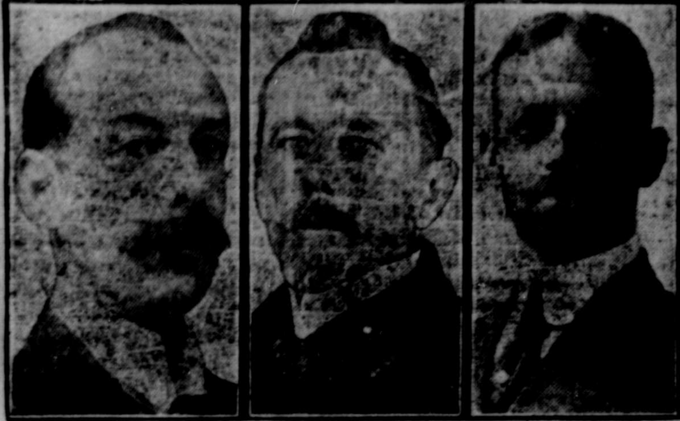
THREE NEW NATIONS DECLARE FOR ALLIES

The favorite household Coal is Ladysmith Wellington. Phone 15, Prince Rupert Coal Co.