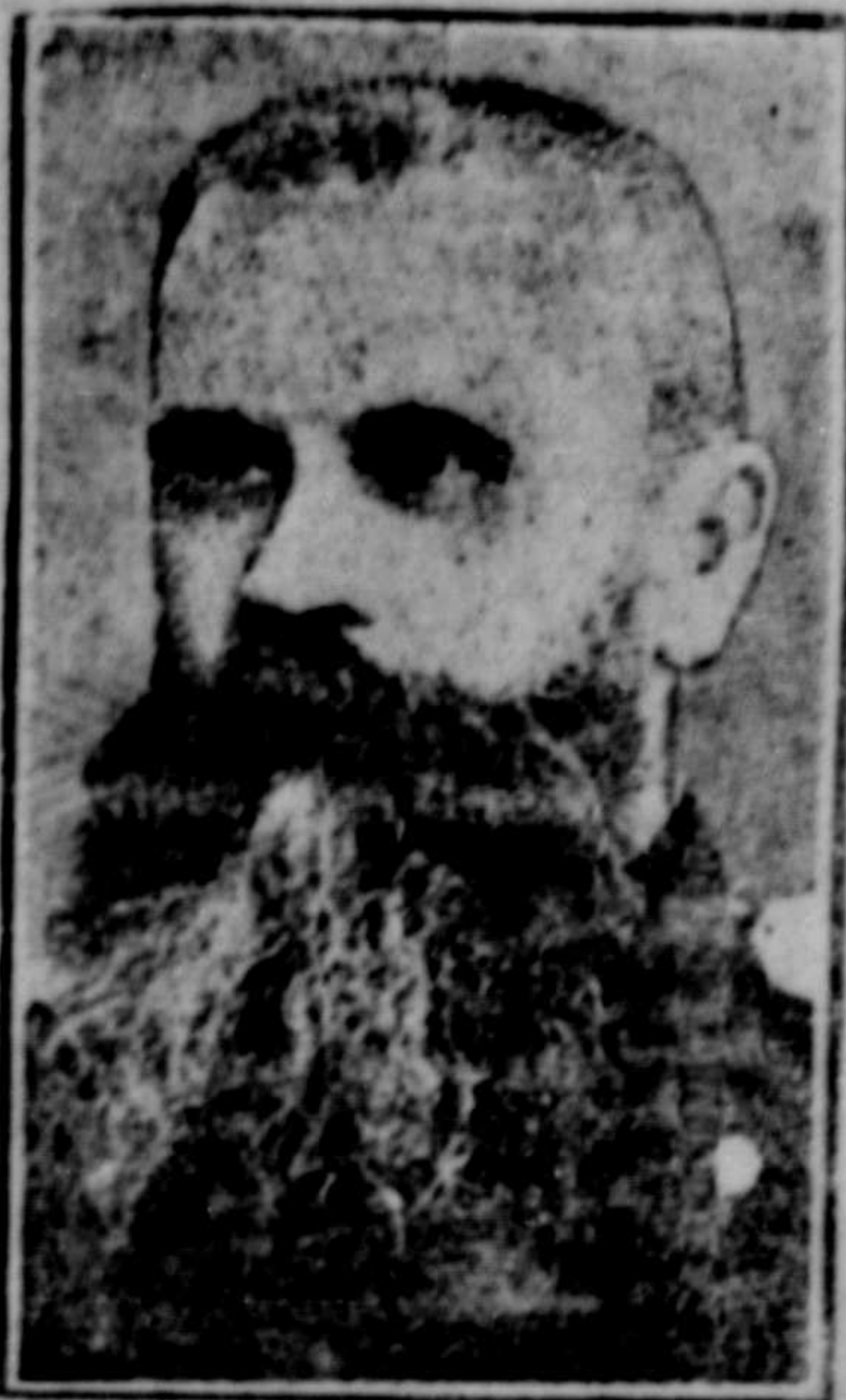
GENERAL I. IVANOFF

Former commander of the Russian armies in Volhynia and Galicia, who is now under arrest.