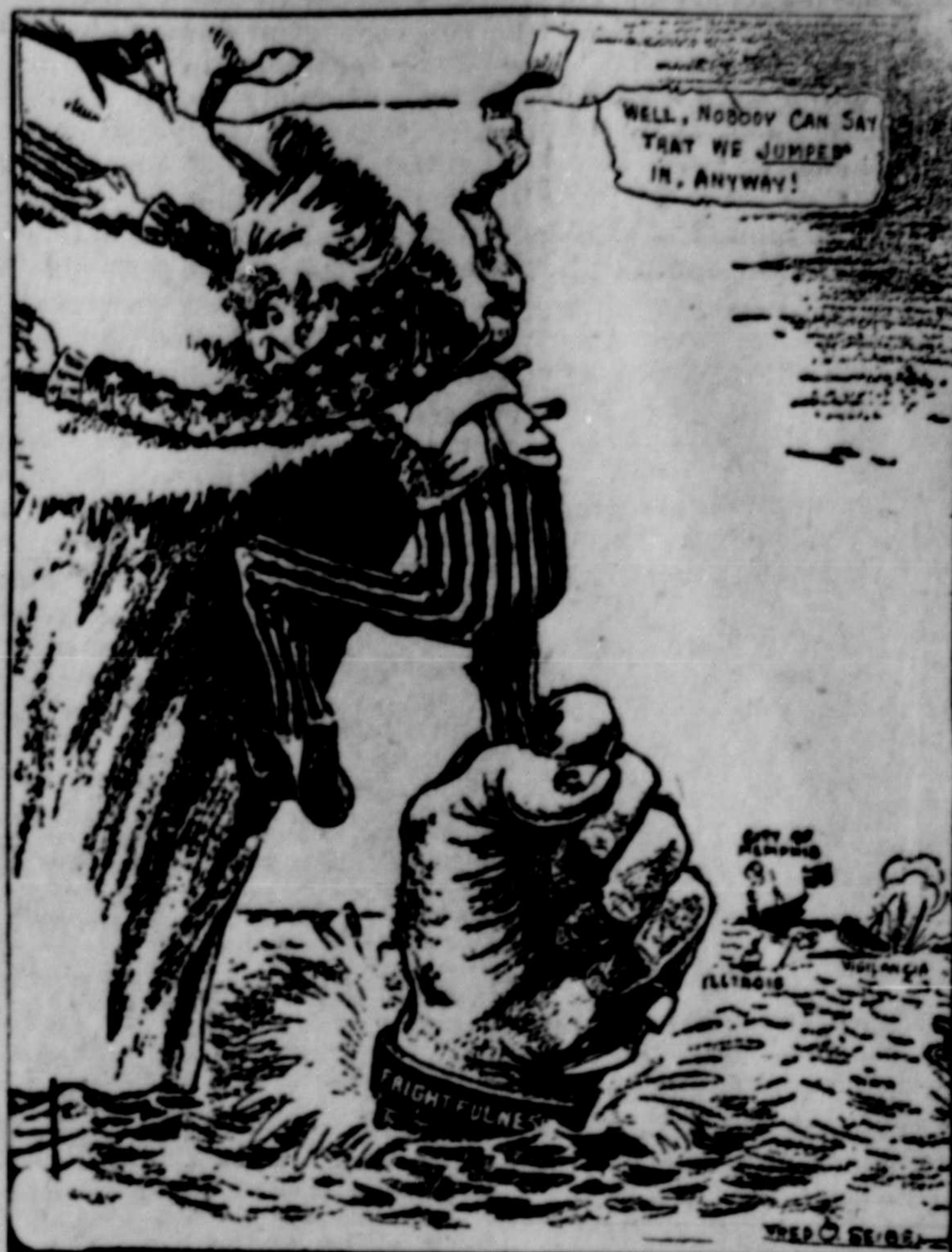
"Some Folks just won't let one alone."—From the Albany Press.

The oldest established Assay Office in the North.