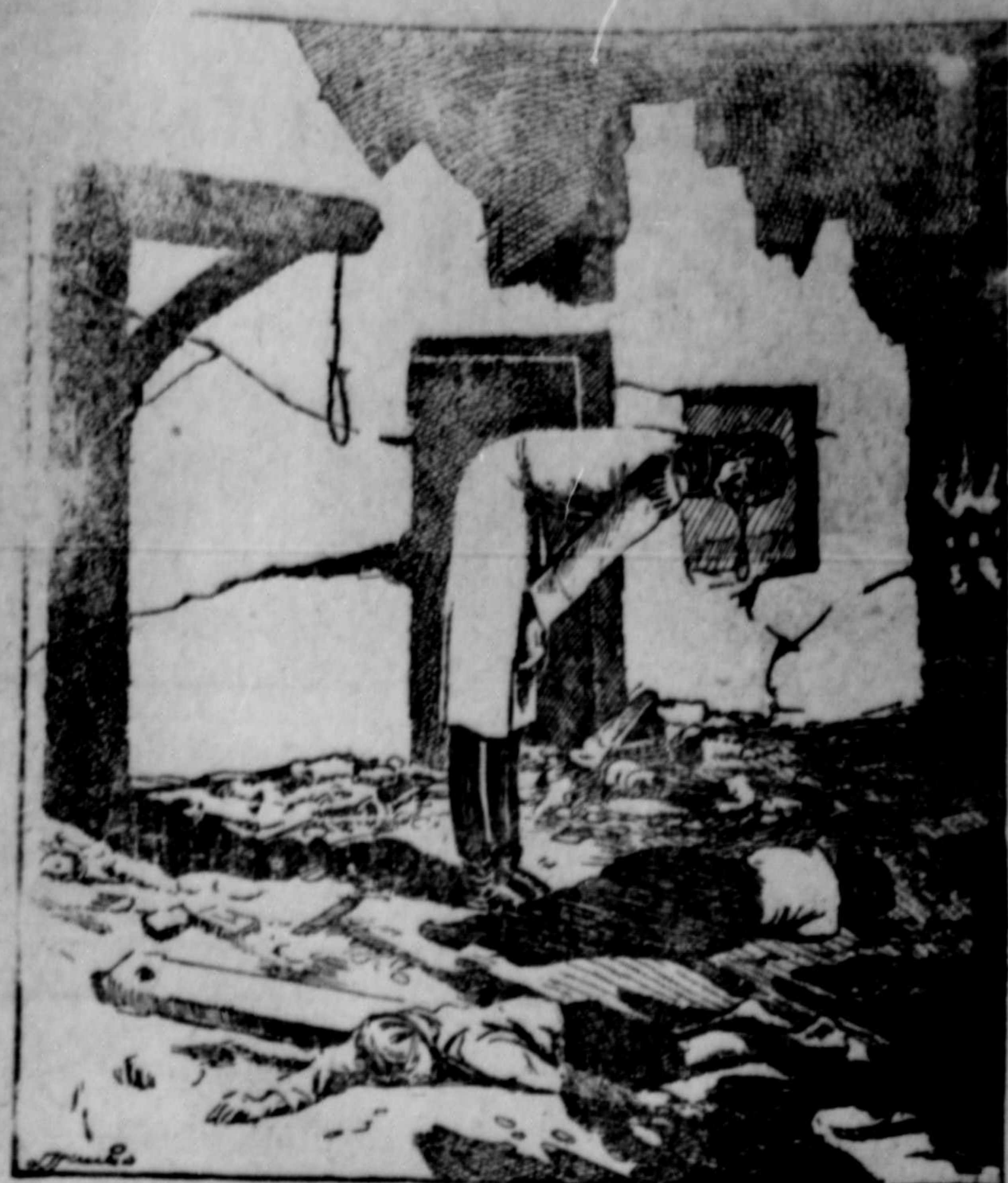
AN OMINOUS SHADOW.—Cartoon from the Toronto World.