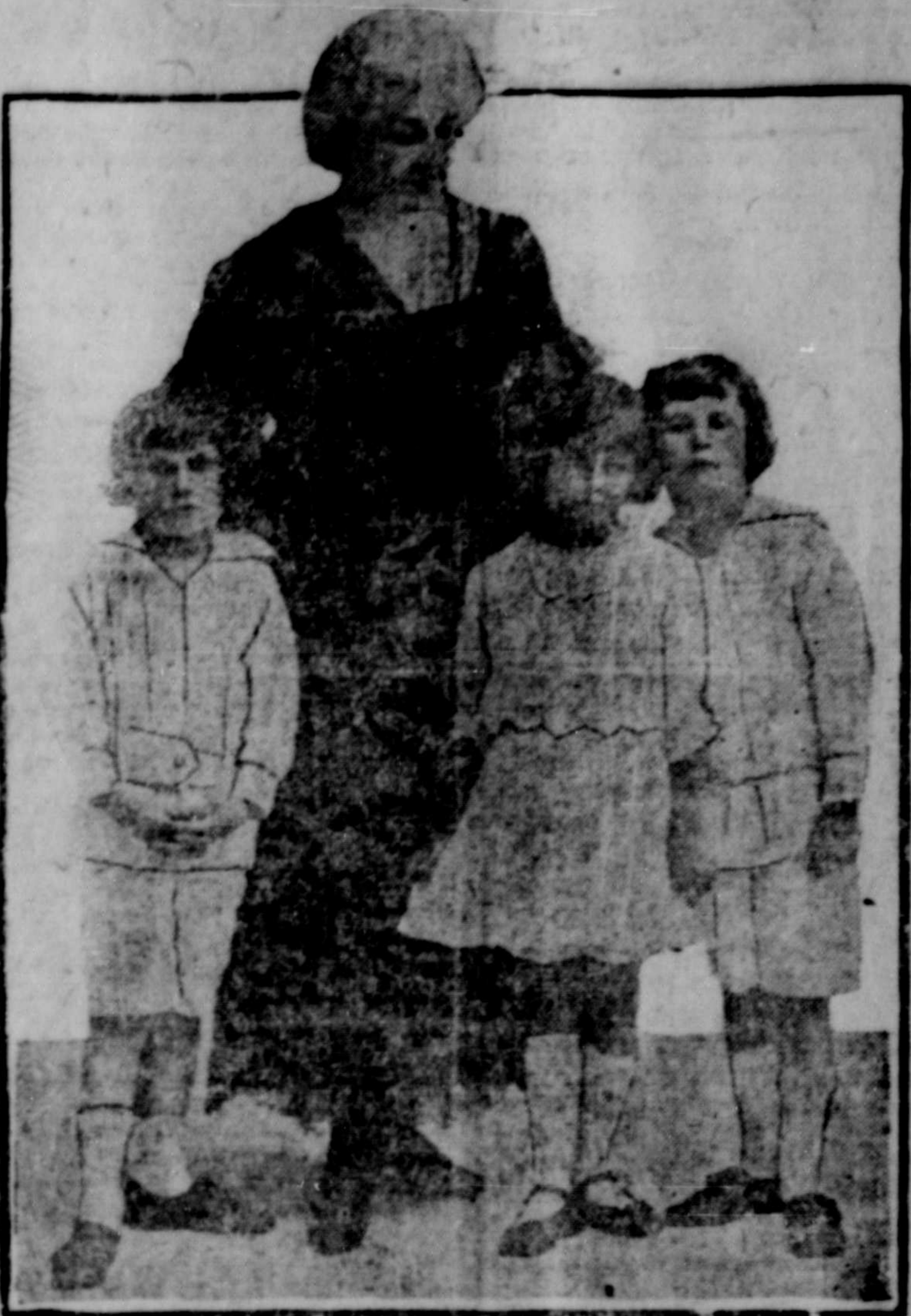
VON HINDENBURG'S "HOSTESS" TO VISIT CANADA

NOTICE TO THE PUBLIC The Telephone system will not be in operation between the hours of 2 a.m. Sunday and Sunday night, April 29, 1917.