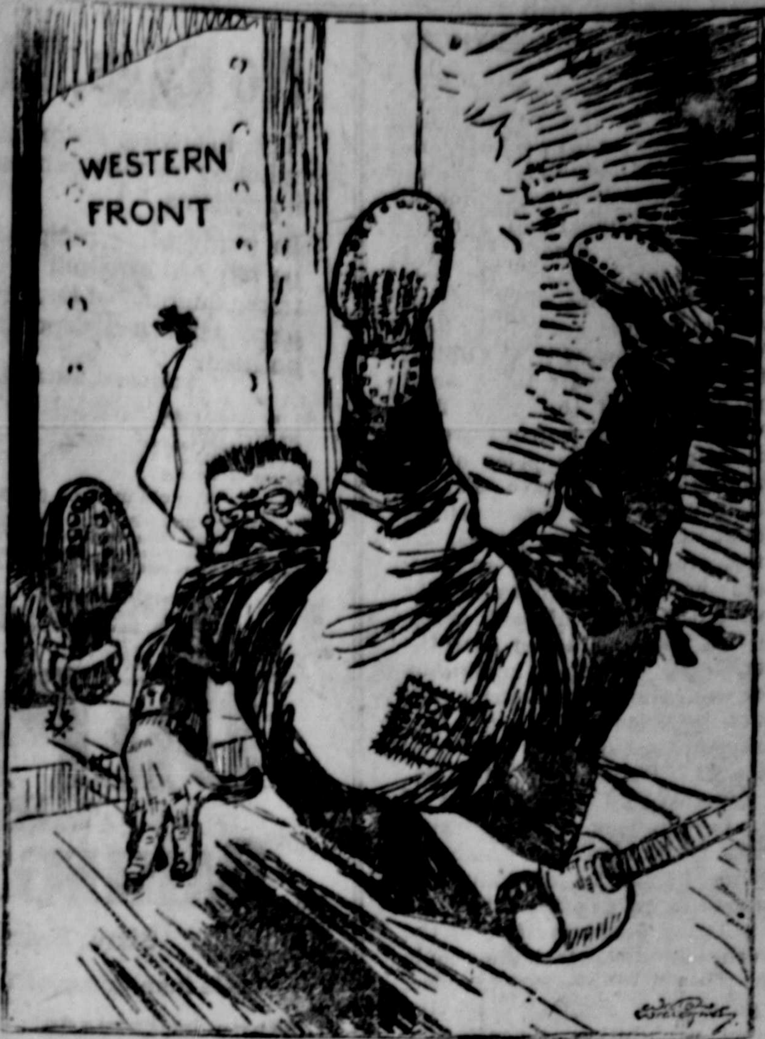
THAT STRATEGIC WITHDRAWAL.—From London Opinion.

30c. a box, 6 for $2.50, trial size, 25c. At all dealers or sent postpaid by Fruit-a-lives Limited, Ottawa.