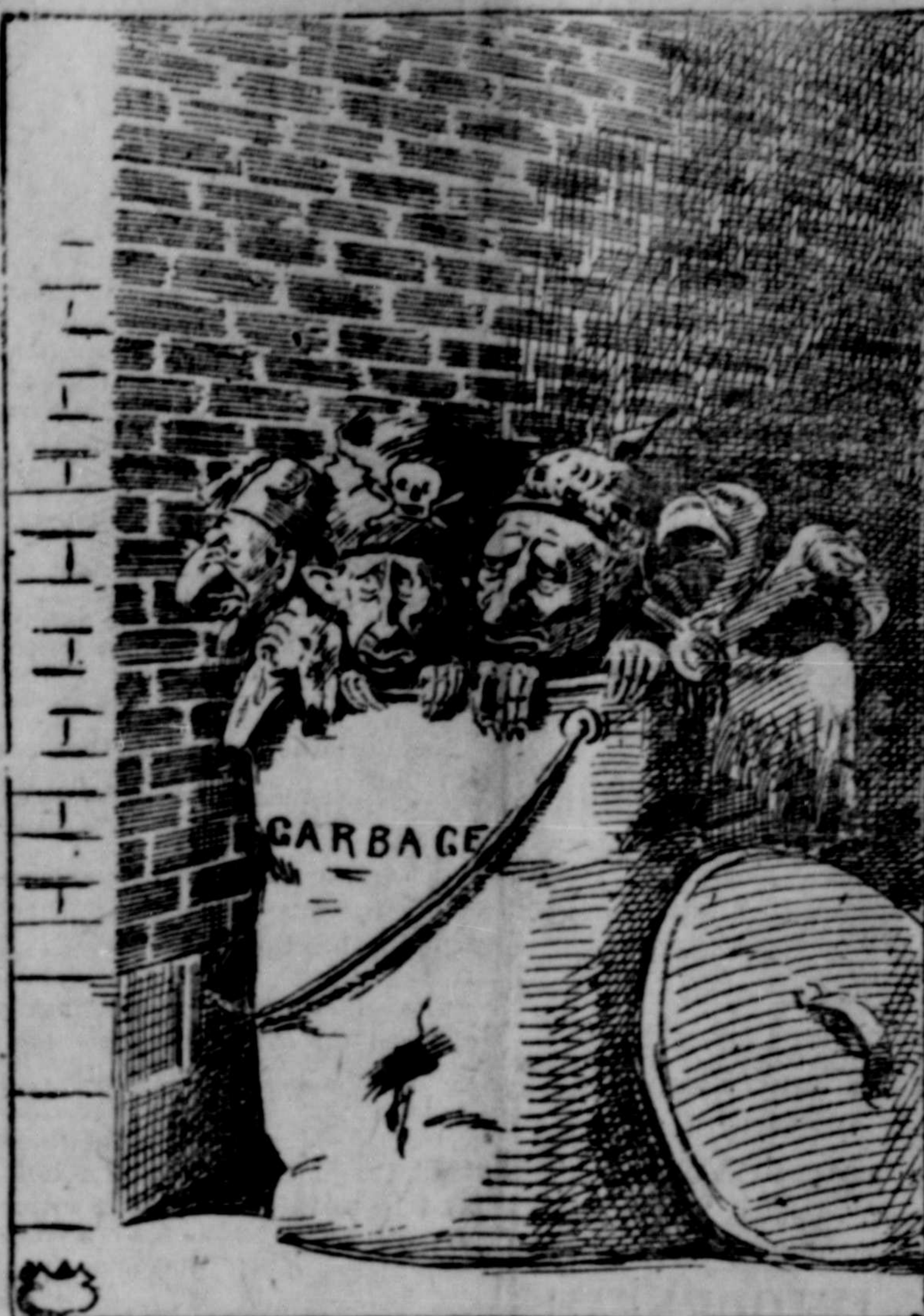
Their Place in the Sun.

Just arrived—100 tons Washed Nut Coal—Albert & McCaffery, Phone 116.