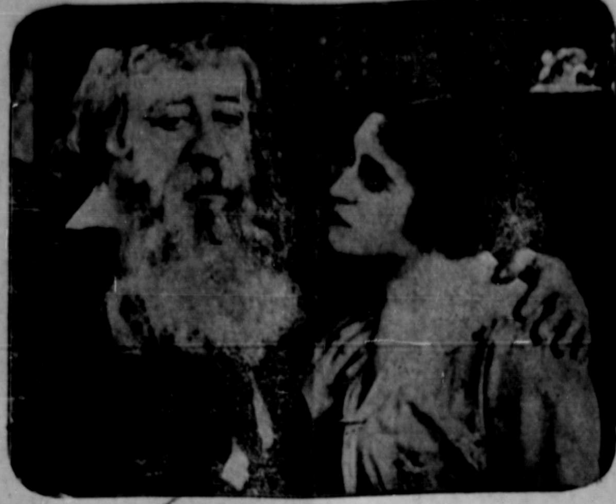
At the Westholme Theatre tonight.