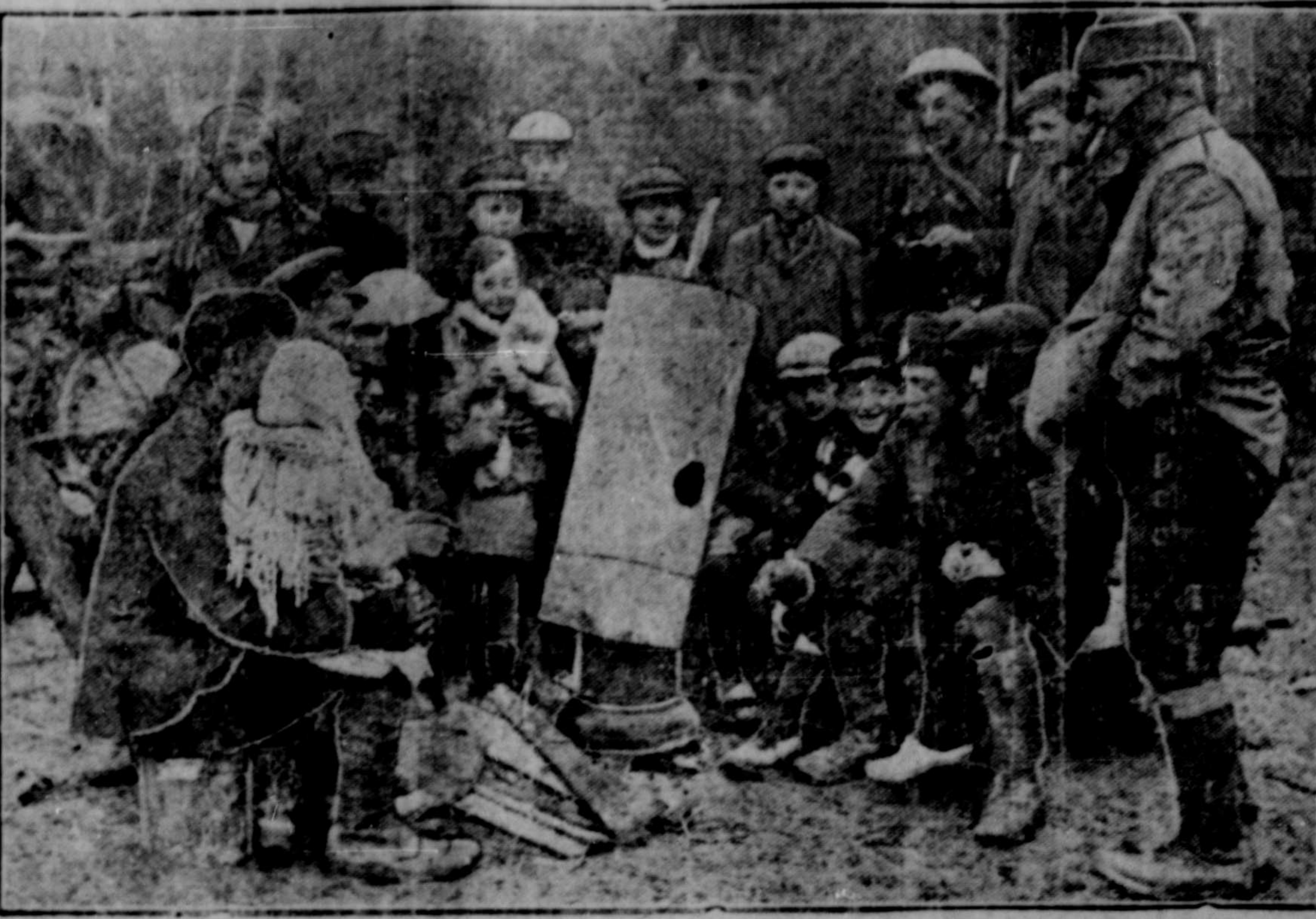
CHILDREN IN RECAPTURED FRENCH VILLAGE MAKE FRIENDS WITH BRITISH SOLDIERS. —British soldiers are very welcome guests in the villages evacuated by the Germans in the great retreat and Tommy soon makes himself at home, although he may find no house whole enough to provide him with shelter. He establishes his temporary fireplace in the village streets and presently the children gather round it for warmth and soon make friends with the khaki-clad visitors from over the seas.

London, May 12.—Premier Lloyd George and his colleagues who have been attending a war conference of the Allies in France have returned safely to London.