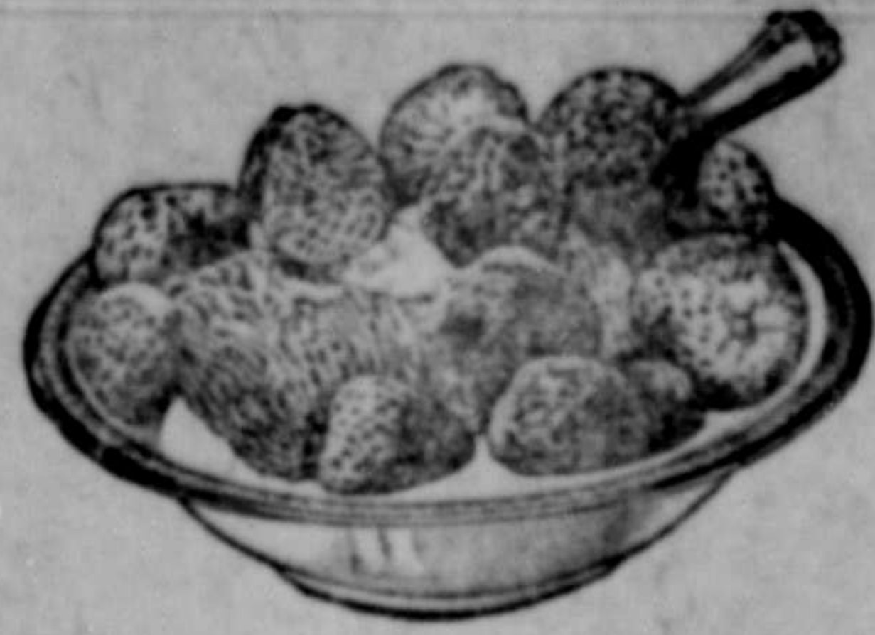
Made in Canada.

Days for the man or woman who is wise enough to jump from the heavy foods of Winter to the cereals, fruits and green vegetables of Spring. Two or three Shredded Wheat Biscuits with berries and milk and some green vegetables make a delicious, nourishing meal. Puts the body in top-notch condition for the day's work.