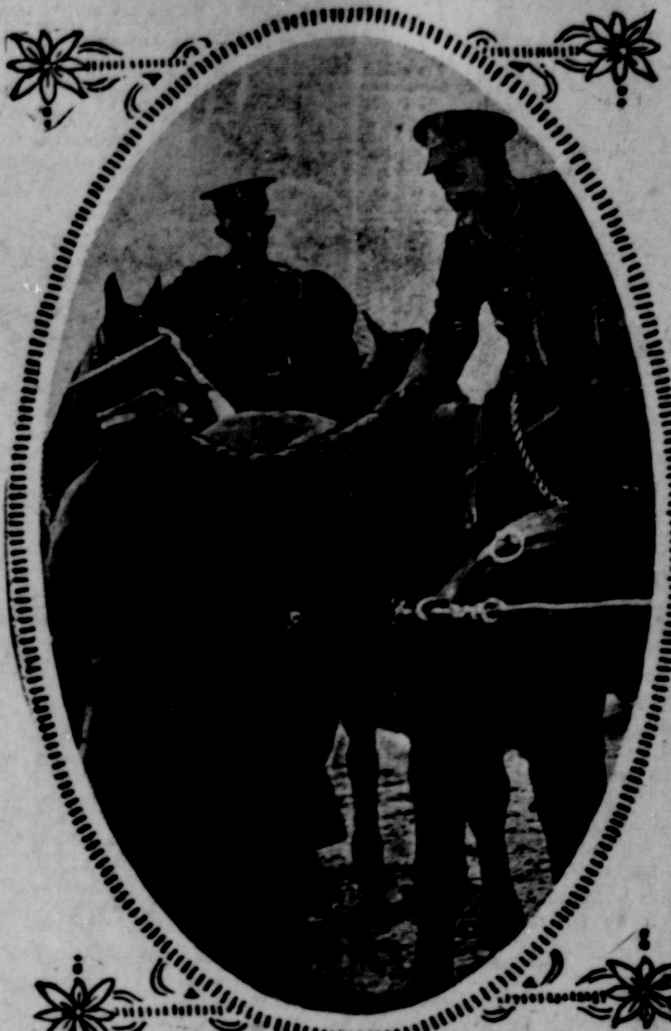
DUKE RECOGNIZES CANADIAN ARTILLERYMAN