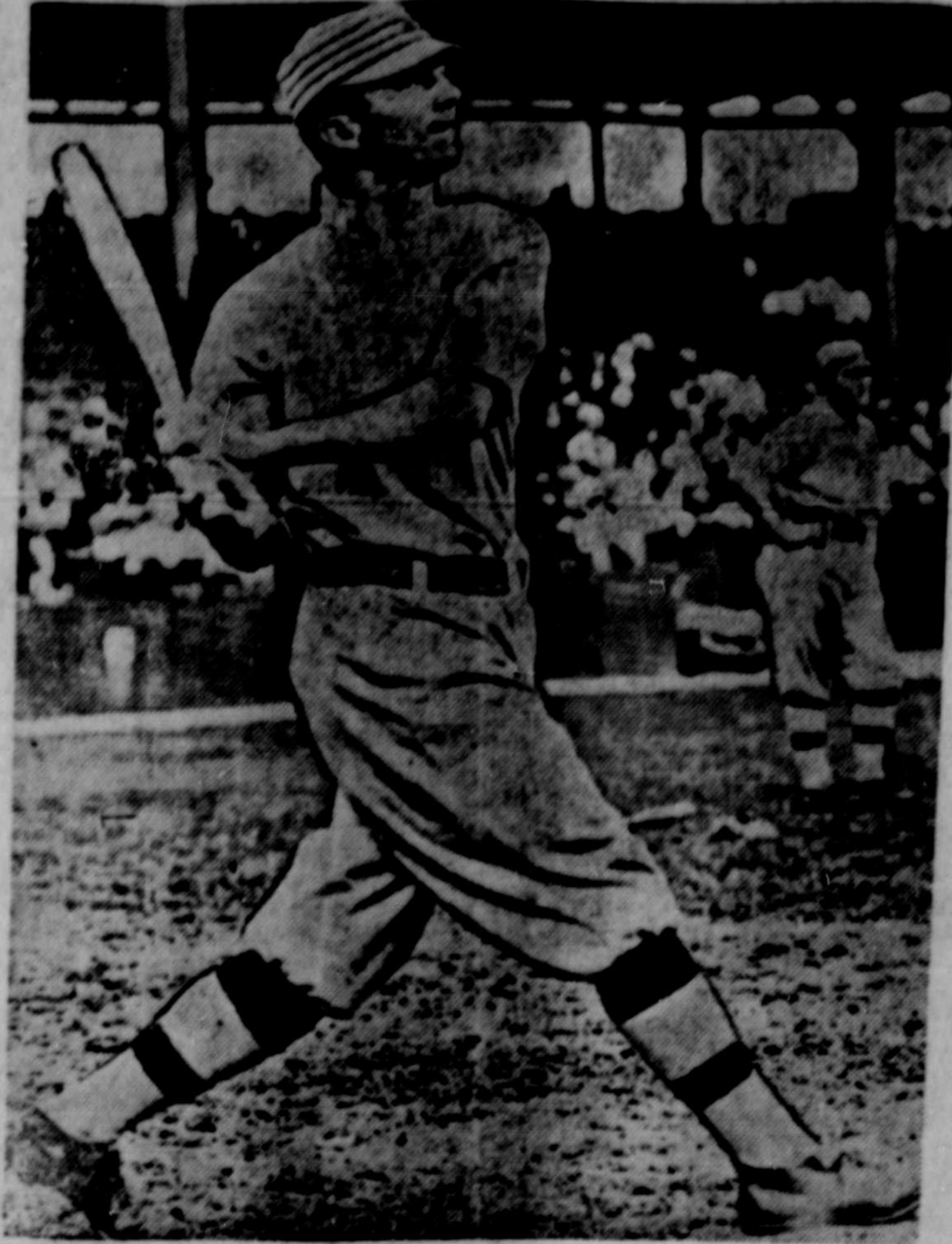
J. FRANKLIN BAKER. —One of Connie Mack's former lieutenants now playing for the New York Americans. Baker is one of the classiest infielders on the majors.

Compared with the rise in the cost of foodstuffs the war-time increase in the prices of drugs has been enormous, and there are no signs that the upward movement in values has come to a stop. In fact, almost every day drugs are becoming dearer. For our supply of medicinal substances we always have been and always shall be dependent to a very large extent on oversea sources. Many of the most important vegetable drugs cannot be grown—at any rate economically—on our soil and in our climate, and although we may look forward to a future when practically every item of materia medica will be produced within the Empire, the fact remains that whenever oversea communications are dislocated our supplies will be curtailed. Such commonly used drugs as sarsaparilla, storax, myrrh, guaiacum, coca leaves, juniper berries, liquorice root, valerian, and many others are extremely scarce, and in some cases there is a possibility that except for small quantities in chemists' shops here and there, certain drugs will before long be unobtainable. Fortunately we can do very well without many of them, for if one remedy for rheumatism, say, becomes extinct, there will always be an adequate