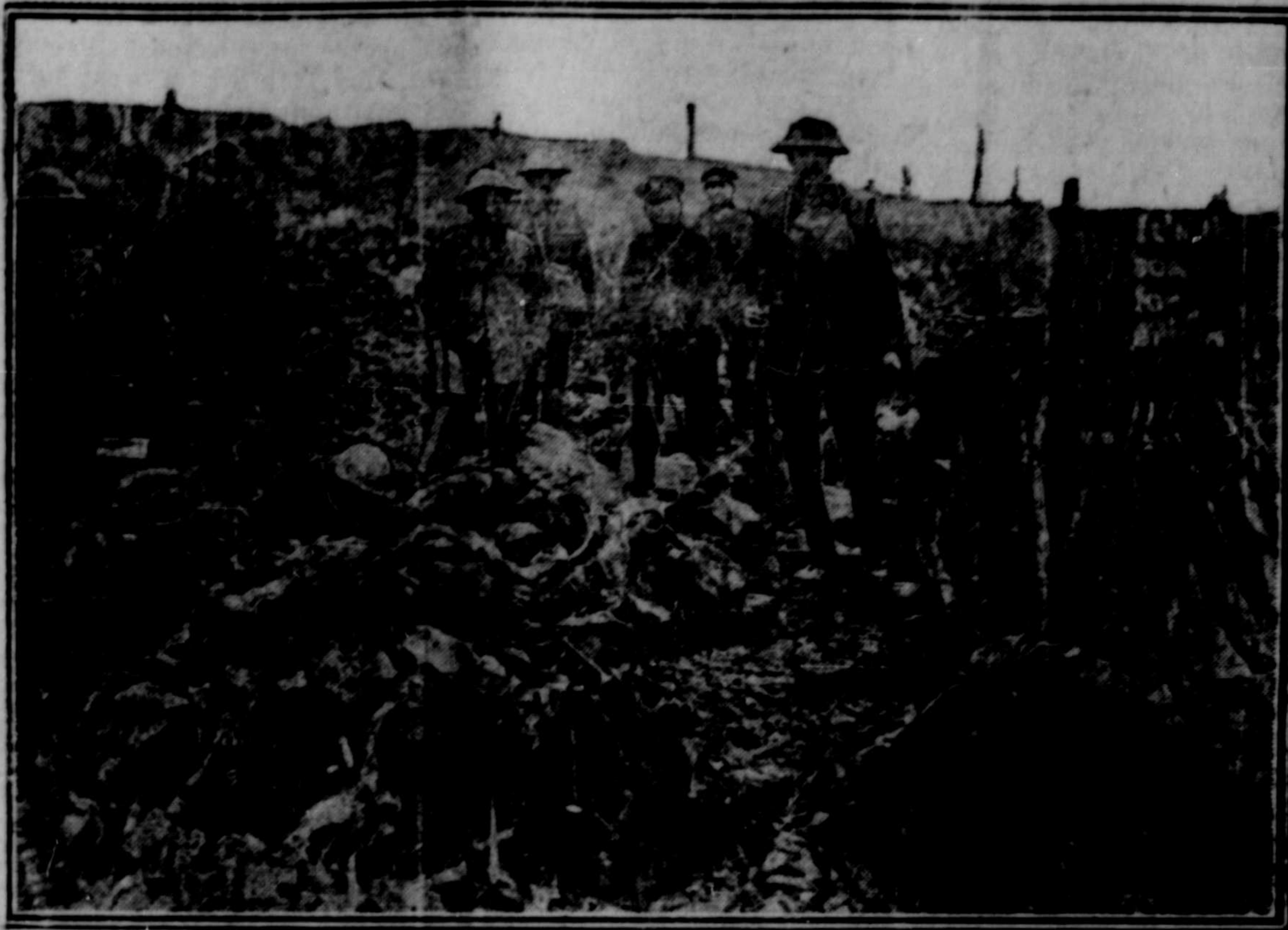
BATTLEFIELD ON THE WESTERN FRONT. —These British Tommies are enjoying a short rest awaiting orders to move to the attack against the Germans at one of the points, where the Allies are advancing.

(Special to The Daily News.) Melbourne, May 17.—The Nationalists control both houses. Hughes has been defeated in his appeal to the country.