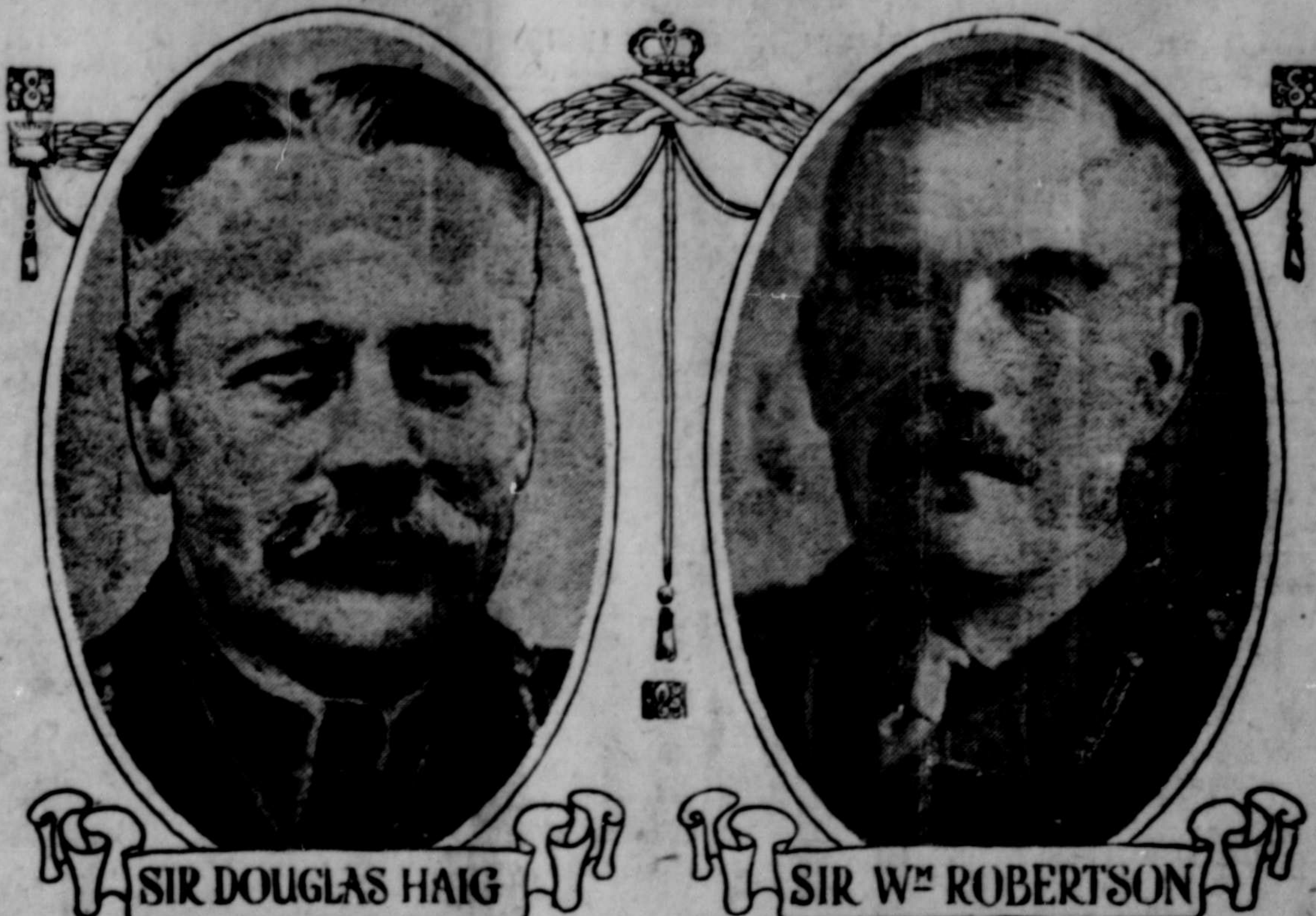
SIR DOUGLAS HAIG