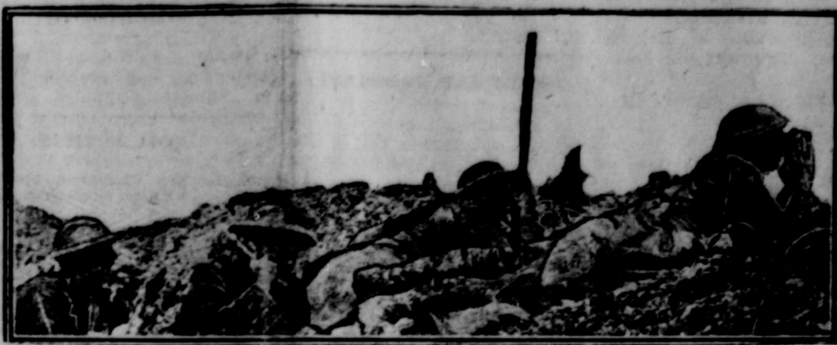
HAZARDOUS WORK OF CANADIAN ARTILLERY SIGNALLERS. —The leading man is sticking his head above cover to use binoculars. The second man is using a periscope, a third is using a telephone and the fourth is probably attending to the wire connections for the telephone. Their job is as near the foe as they can get to watch the effect of their own battery's shells and report back.

Open for business Wednesday afternoon and evening this week. McRae Bros.