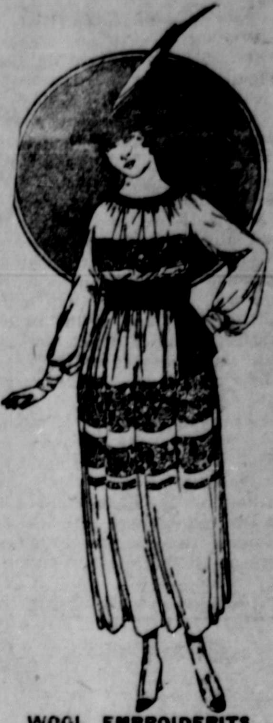
WOOL EMBROIDERITS Here is a pretty dress of grey crepe de chine with deep bands of embroidery in wool of vivid colorings. The deep sash is of Tangerine velvet.

the home market is protected for us apples so that we needn't sell at home. We needn't and we don't. I think it would be cheaper and altogether more satisfactory for the consumer to eat the apples grown, so to speak, at his own door.