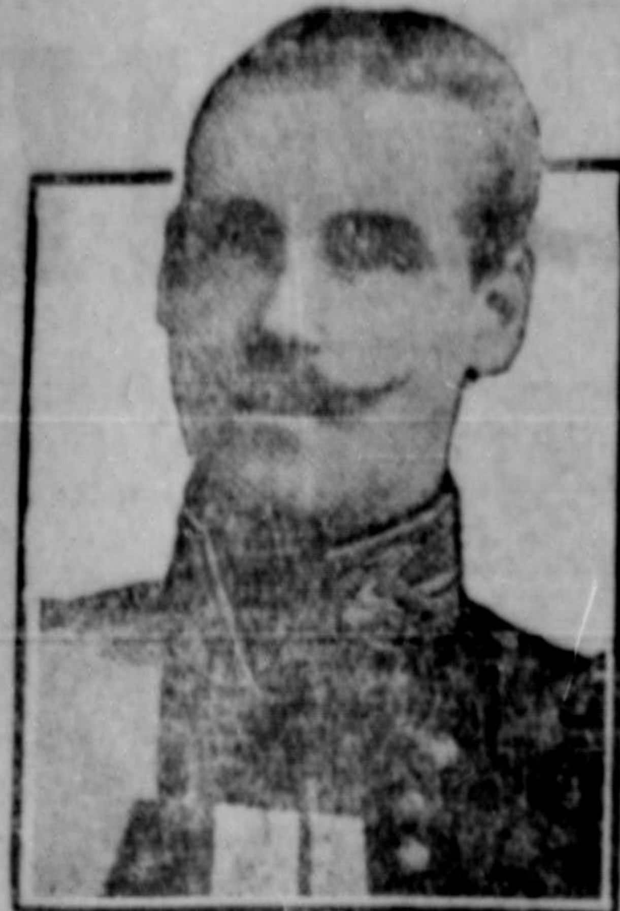
THE GRAND DUKE MICHAEL. Younger brother of the ex-Czar Nicholas. He refused the regency of Russia, unless he was elected by the people, which they have not yet done.