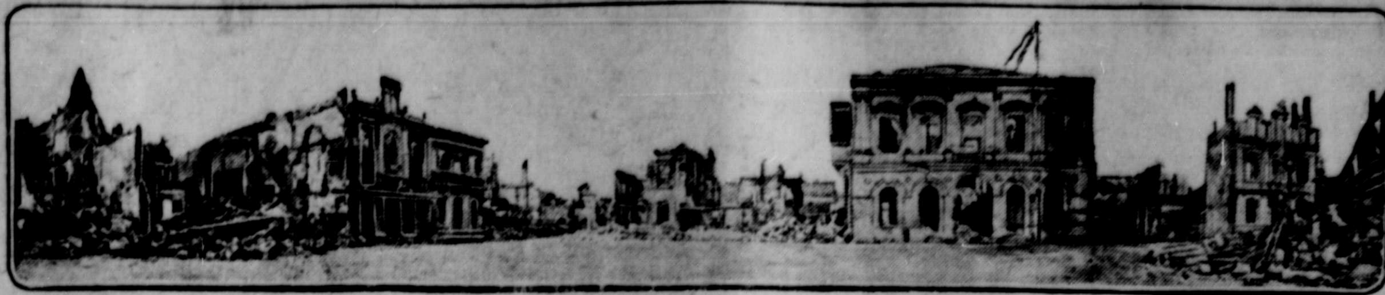
WITH THE FRENCH ON TWESTERN FRONT.—Chauny, a flourishing city of 30,000 inhabitants before the war, stands now as a chef d'oeuvre or masterpiece of kultur. Before retreating, the Huns destroyed it entirely, leaving nothing but ruins. The photo shows Place D'Hotel de Ville.