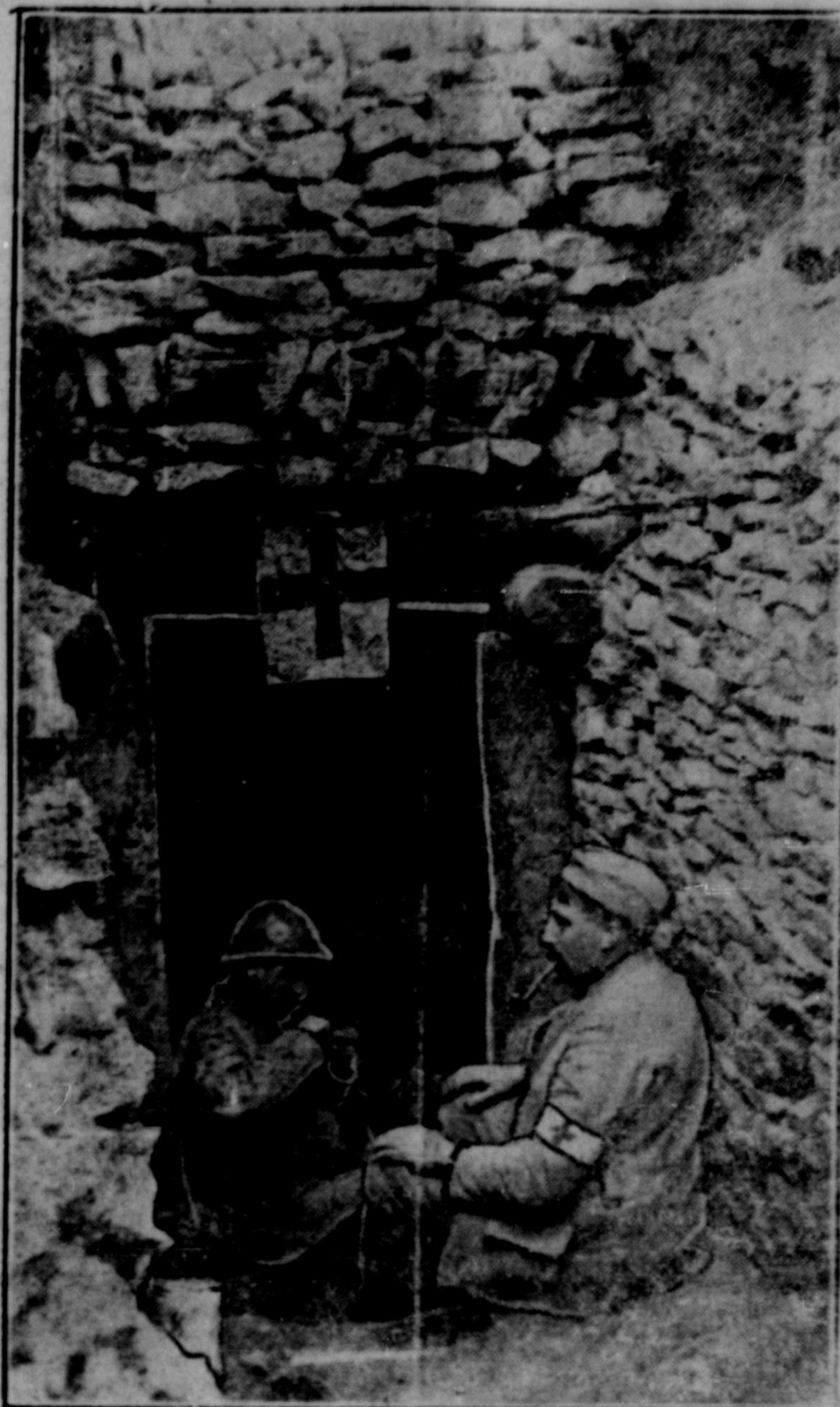
PREPARING BLACK COFFEE IN FRENCH TRENCHES

The favorite household Coal is Ladysmith Wellington. Phone 15. Prince Rupert Coal Co.