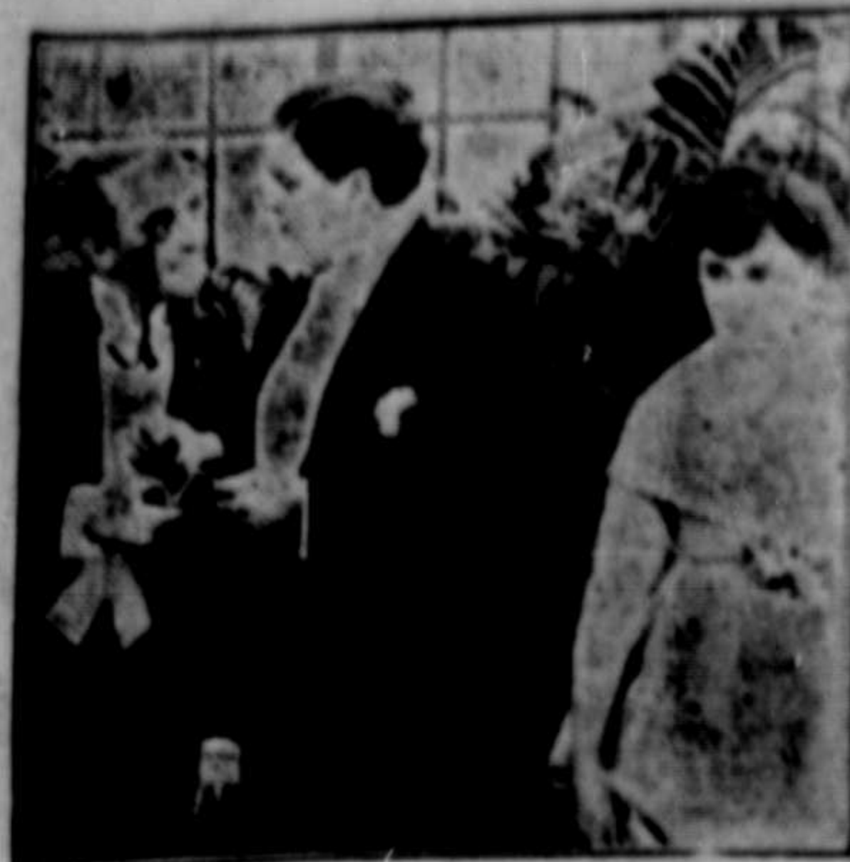
Scene from "The Gilded Fool" to be shown at the Westholme Theatre tonight.

ALBERT & McCAFFERY LIMITED Dated 22nd May, 1917. J24