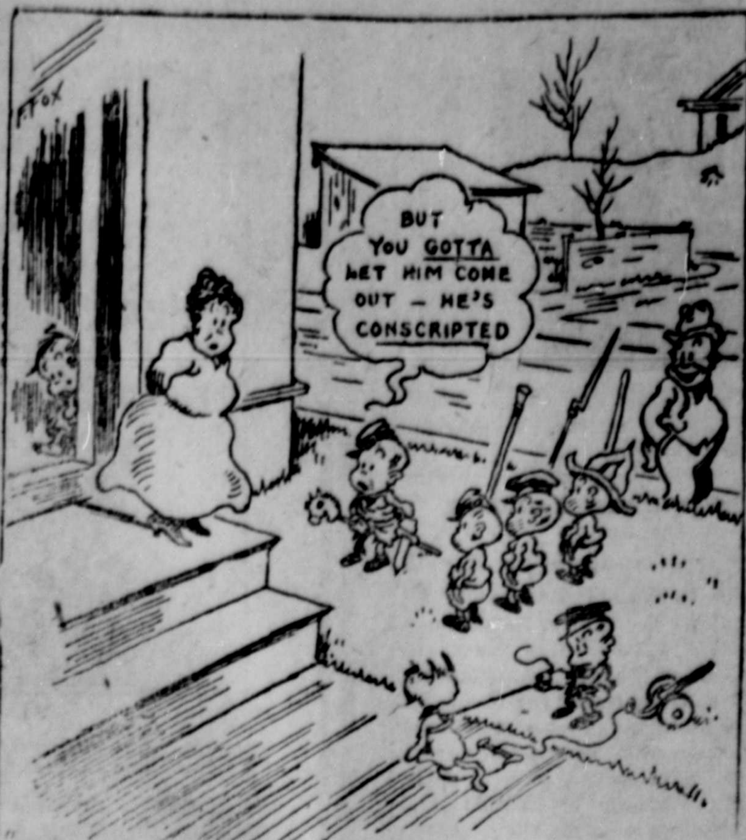
The last desperate effort to make Ma let Jimmie come out. By Fox, in the New York Evening Post.