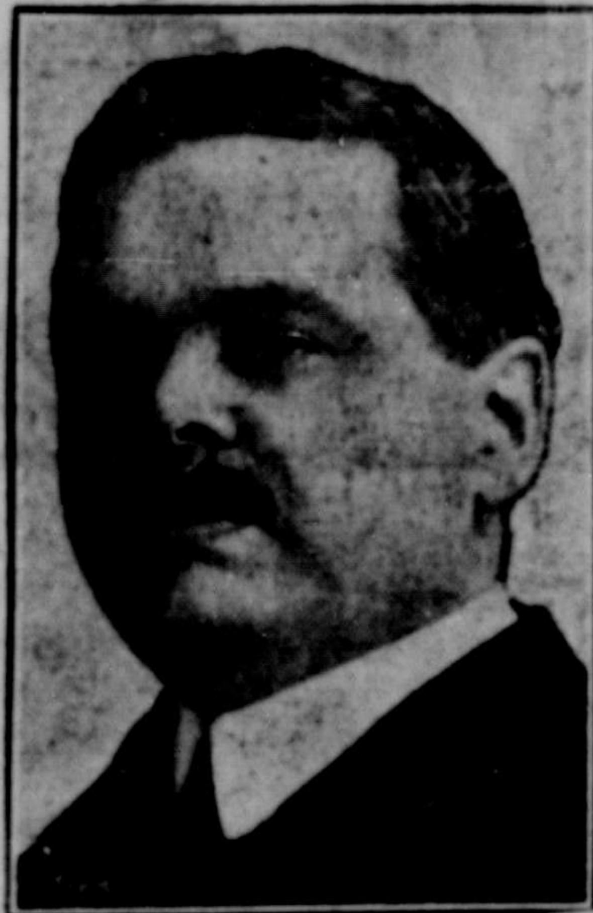
SIR LOMER GOUIN

Calgary, June 8.—The election of members to the provincial House held throughout the province yesterday has resulted in the return of thirty-eight Liberals and eighteen Conservatives. All the members of the cabinet have been returned. All members at present with the forces were returned by acclamation.