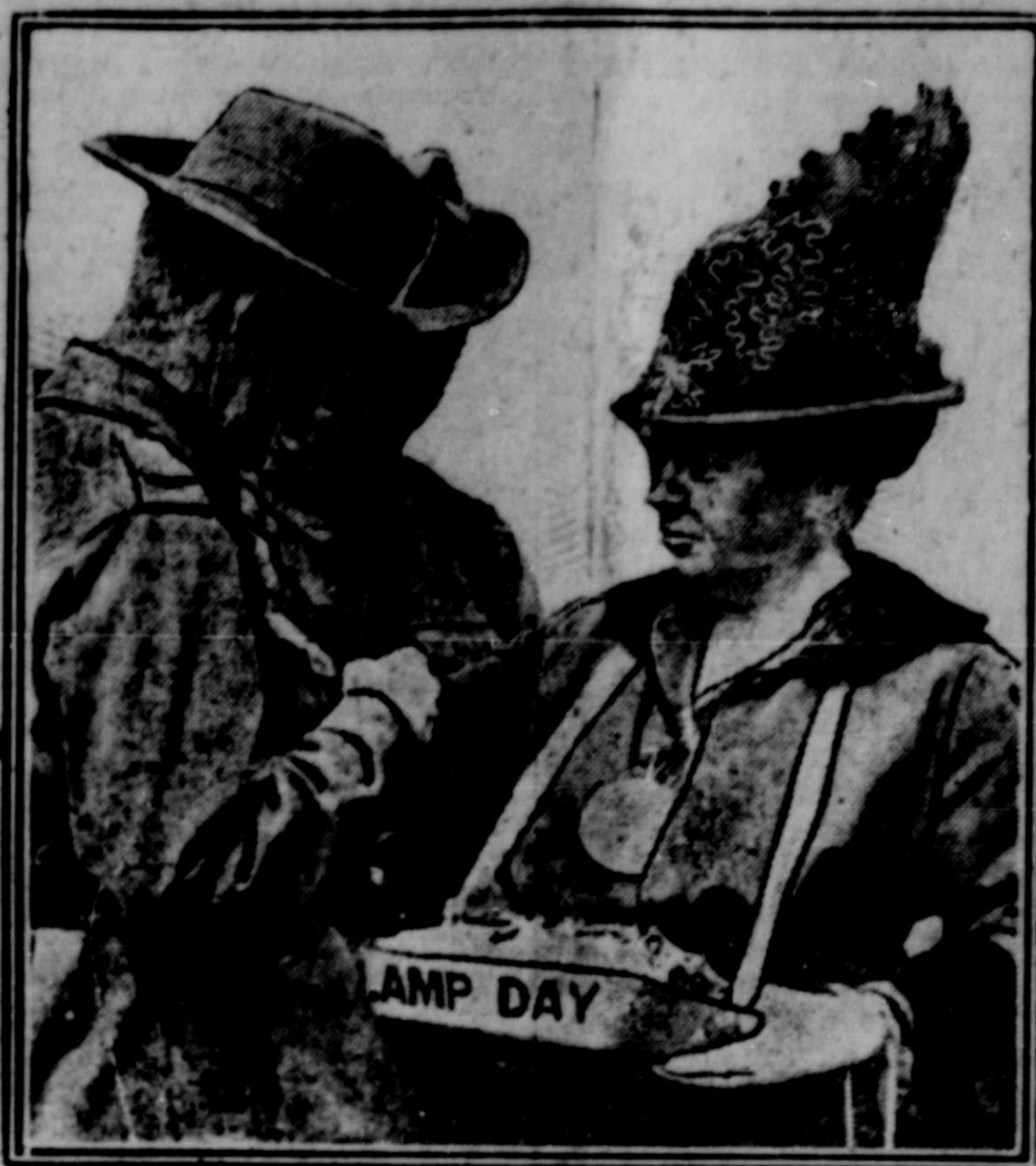
A NEW PICTURE OF MRS LLOYD GEORGE