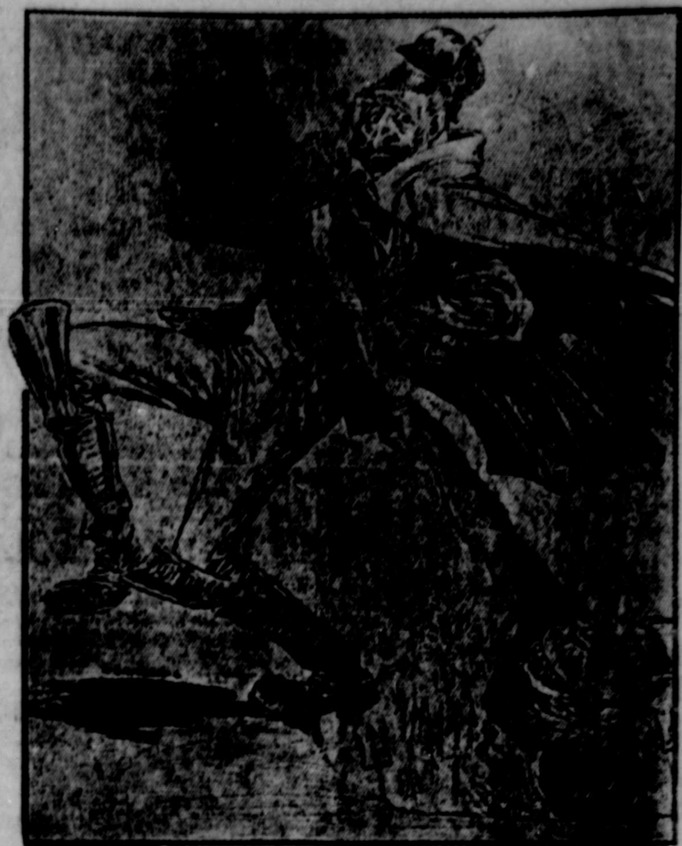
"Falling back on a prepared position."—From London Bystander.