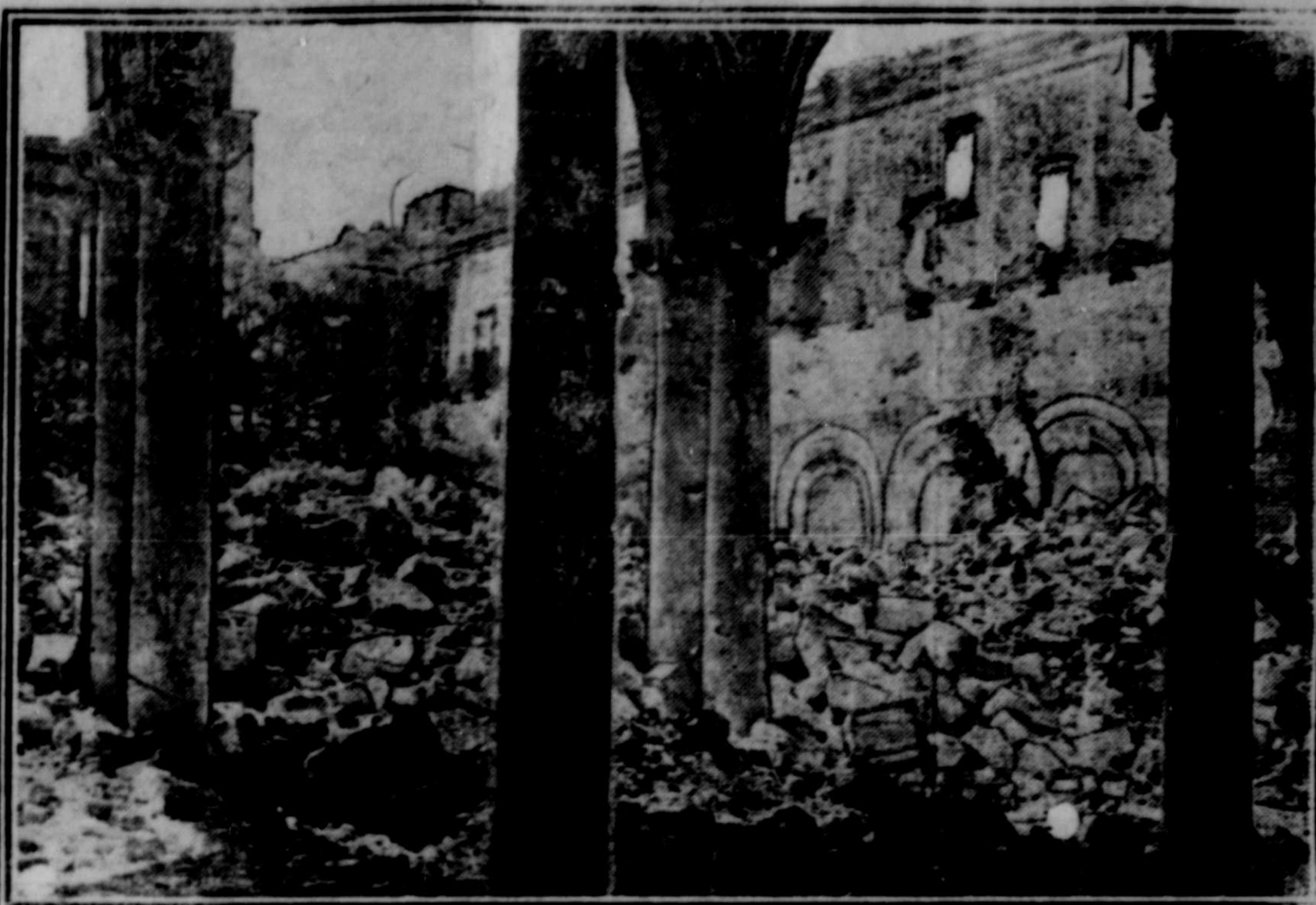
THE STONES OF ARRAS—JUST ONE MORE EXAMPLE OF GERMAN BARBARISM.—Our photo shows the ruins of a part of the Cathedral of Arras, which was built between 1755 and 1833 on the site of the old Abbey Church. Though architecturally of less note than the "Stones of Venice" Arras Cathedral was a fine building—fine enough for the Germans to destroy. What it lacked in past history, it has made up during the war.

single men between the ages of twenty and twenty-three. Two men will be appointed to sit on a Board of Exemption in each locality. One member of this board will be chosen by the senior county judge, and the other by Parliament. Any man who does not get exemption will be considered eligible and liable for service. An Appeal Tribunal will also be established.