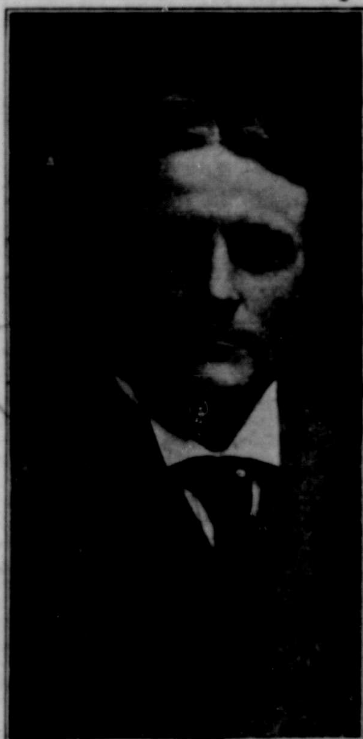
THE HON. T. D. PATTULLO

"Certain undesirable interests are fighting the Government in every way they know," remarked the Hon. Mr. Pattullo, "because