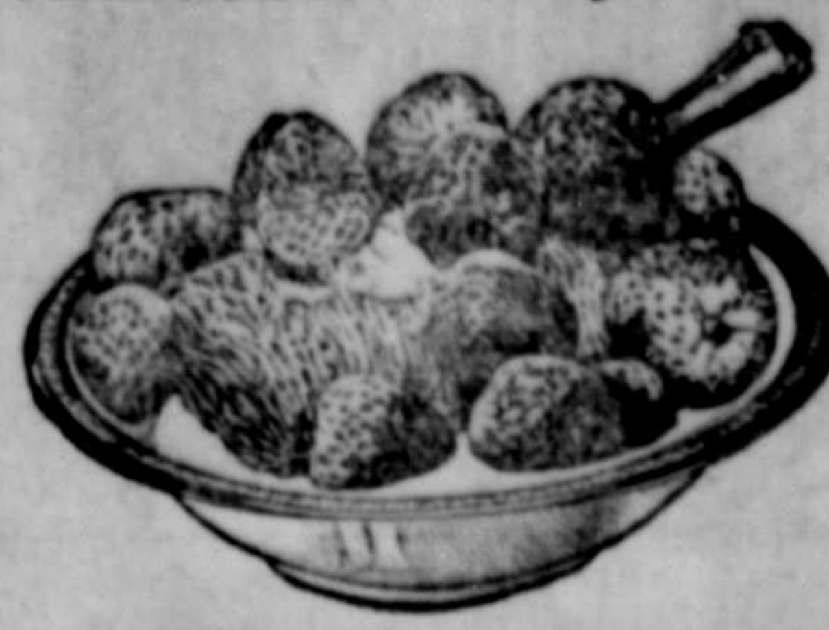
Made in Canada.

Spring Days are Joy Days for the man or woman who is wise enough to jump from the heavy foods of Winter to the cereals, fruits and green vegetables of Spring. Two or three Shredded Wheat Biscuits with berries and milk and some green vegetables make a delicious, nourishing meal. Puts the body in top-notch condition for the day's work.