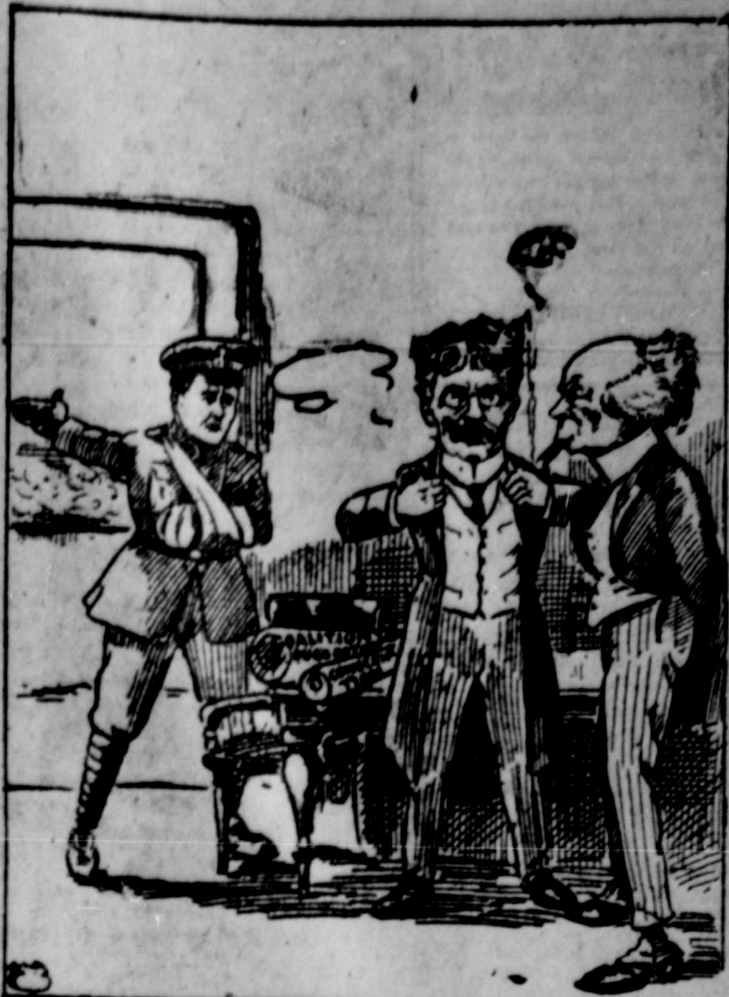
TAKE YOUR TIME, GENTLEMEN—shades in Toronto Telegram.

"FRUIT-A-LIVES" is the only medicine in the world that is made from the juices of fresh ripe fruits. Thus, it is manifestly unfair to say, "I won't take Fruit-a-lives because I have tried other remedies and they did me no good!" On the other hand, the fact that "Fruit-a-lives" is entirely different from any other preparation in the world, is just why you should give it a fair trial, in any trouble of the Stomach, Liver, Bowels, Kidneys or Skin. "Fruit-a-lives" is composed of the active principle of fruit and the greatest nerve tonic ever discovered. 50c. a box, 6 for $2.50, trial size, 25c. At all dealers or sent postpaid by Fruit-a-lives Limited, Ottawa.