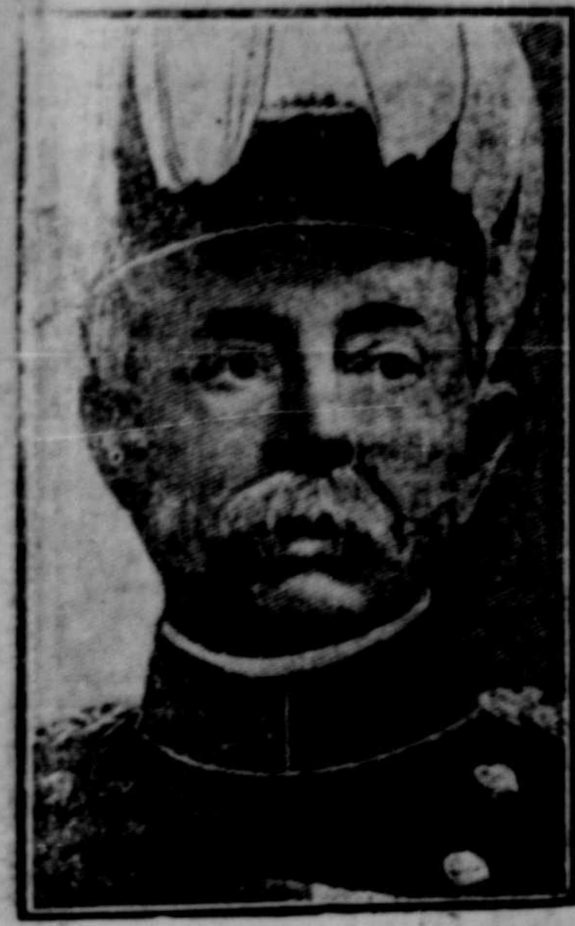
Lieut.-General Sir H. C. O. Plumer. Commander of the second British army, which won the big victory on the Messines Ridge.

(Special to The Daily News.) Petrograd, June 16.—The leaders of the Soldiers and Workmen committees in Russia have treated the notes received from the British, French and American Governments scornfully. The notes have been definitely rejected by the delegates. The revolutionaries seem bent upon undermining the alliance. Even the press are united and loud in their denunciation of the proposals, and say President Wilson is the worst offender. The pacifists are active, and say that as the Government has failed, it is now up to the people to take action.