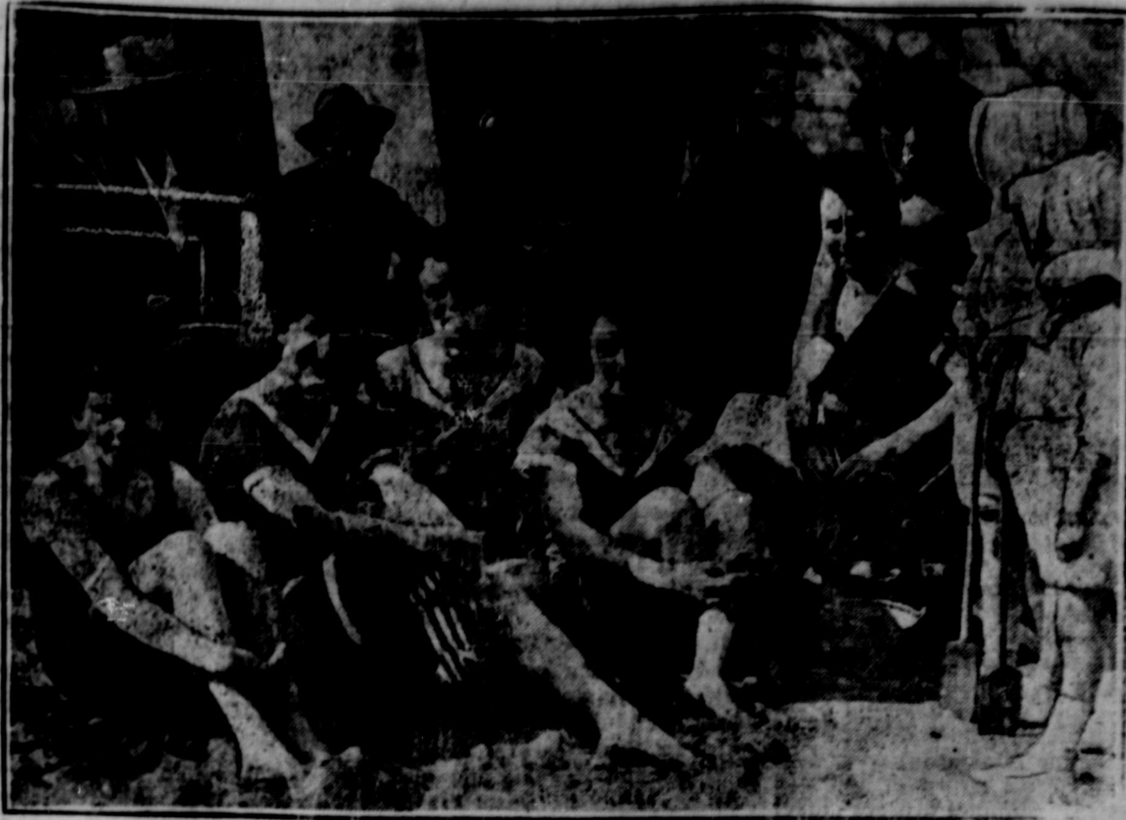
WHERE IT IS WARM ENOUGH TO BASK ON THE BEACH.—Here is a typical scene of the English bathing beach, where everybody appears to be happy. It will be noticed that the male representation does not include eligibles between the ages of eighteen and forty-one and the fair bathers this year must do without an escort.

50c. a box, 6 for $2.50, trial size, 25c. At all dealers or sent postpaid on receipt of price by Fruit-a-tives Limited, Ottawa.