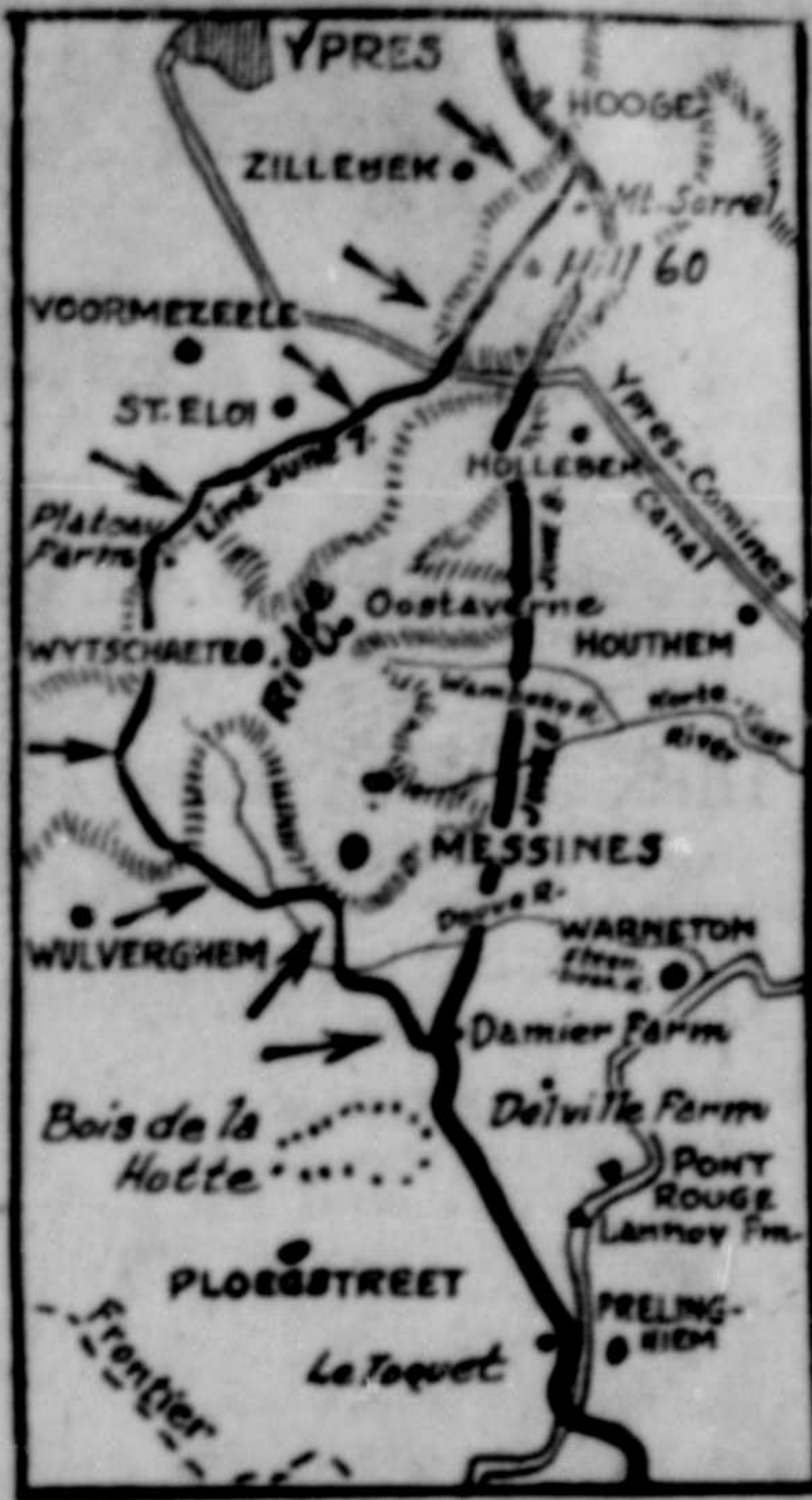
ADVANCE TWO MILES DEEP. The map shows the former battle front and the British line after the successes along a front of ten miles, which included the capture of important points, and six thousand prisoners.

(Special to The Daily News.) London, June 16.—General Haig's troops drove forward today and struck another rapid blow at the German lines, between Ypres and Comines, gaining all objectives. One hundred and fifty prisoners, a number of howitzers and seven machine guns were captured. The British now occupy the former front trenches of the Germans from the River Lys to the River Warnave.