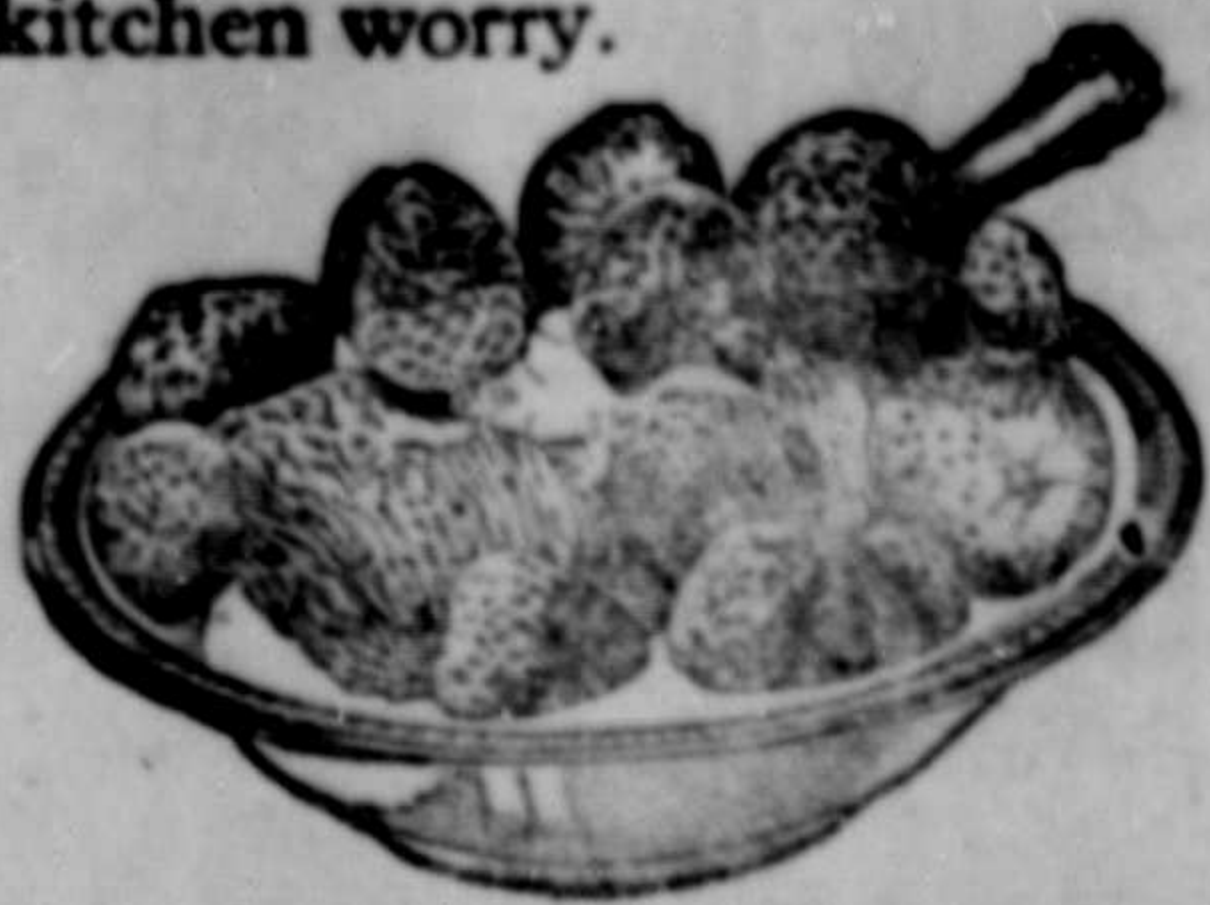
Made in Canada.

Appetite Finicky and Fussy? Tempt it with a light, nutritious food that helps you to shake off the shackles of a Winter diet. Eat Shredded Wheat Biscuit with berries and cream or milk. Two or three Biscuits with fruits and green vegetables make a nourishing, satisfying meal at a cost of a few cents. Ready-to-eat—no cookery, no kitchen worry.