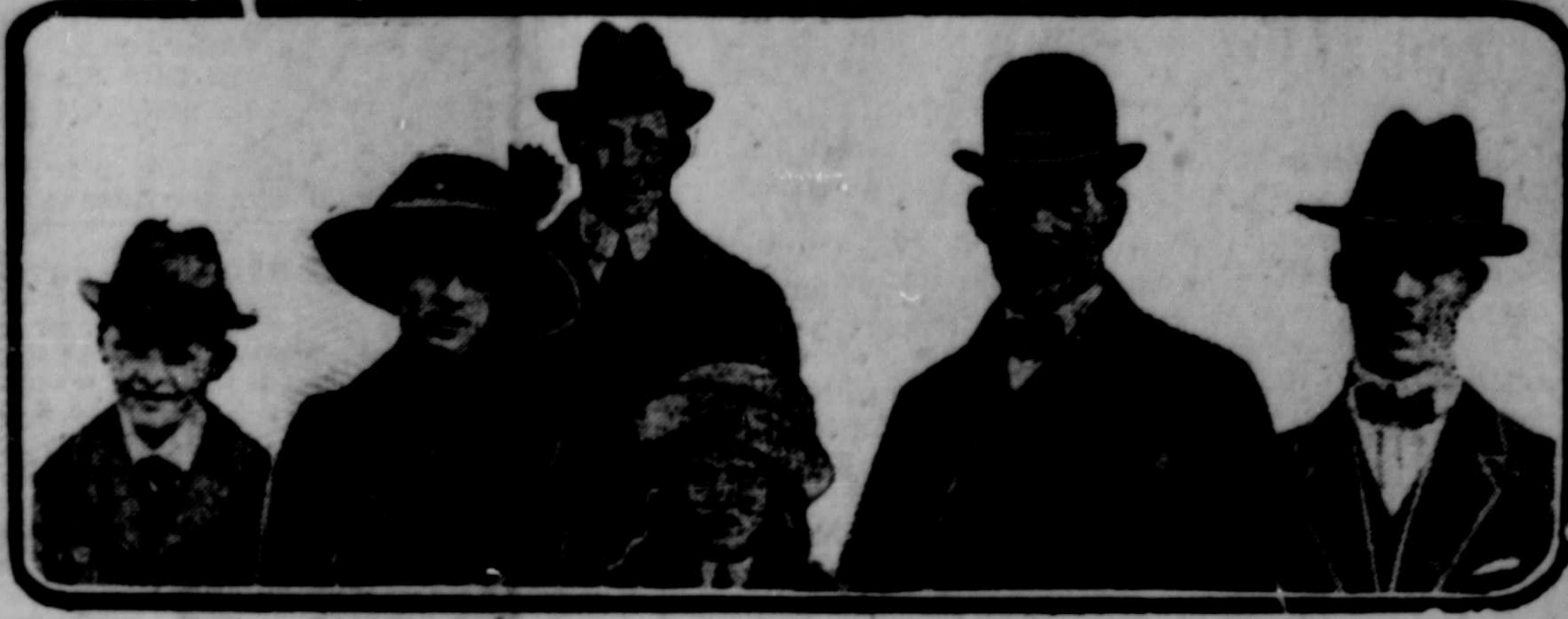
PRINCE ALEXANDER OF GREECE SUCCEEDS KING CONSTANTINE. —Prince Alexander, Constantine's second son, in whose favor the King of the Hellenes abdicated, is the third figure from the left. He was born on August 1st, 1893.