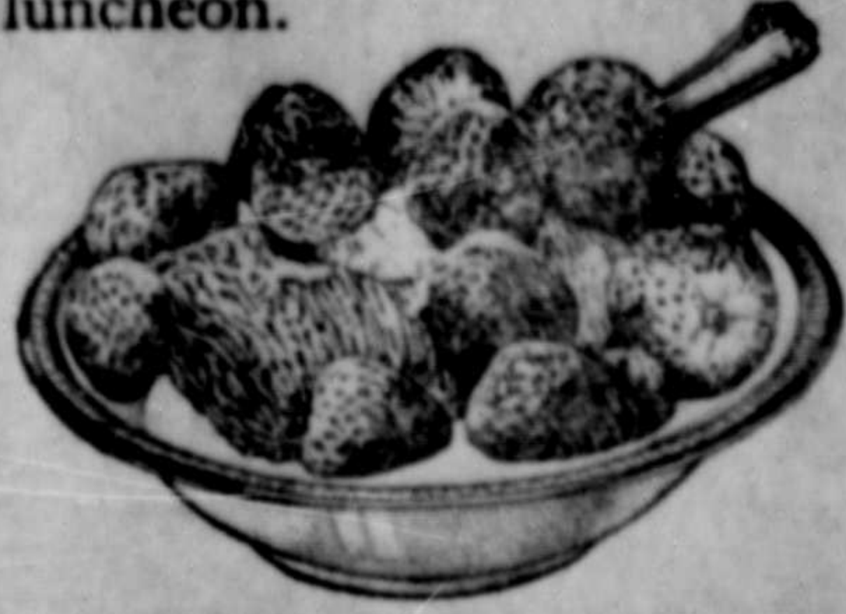
Made in Canada.

Joy for that Jaded Stomach, with vim and energy for the day's work—Shredded Wheat with Strawberries, or other fruits—a combination of cooked whole wheat and the most luscious and succulent of berries. The highest food value for the least money and the least bother. It is ready-cooked and ready-to-eat. Try it for breakfast or luncheon.