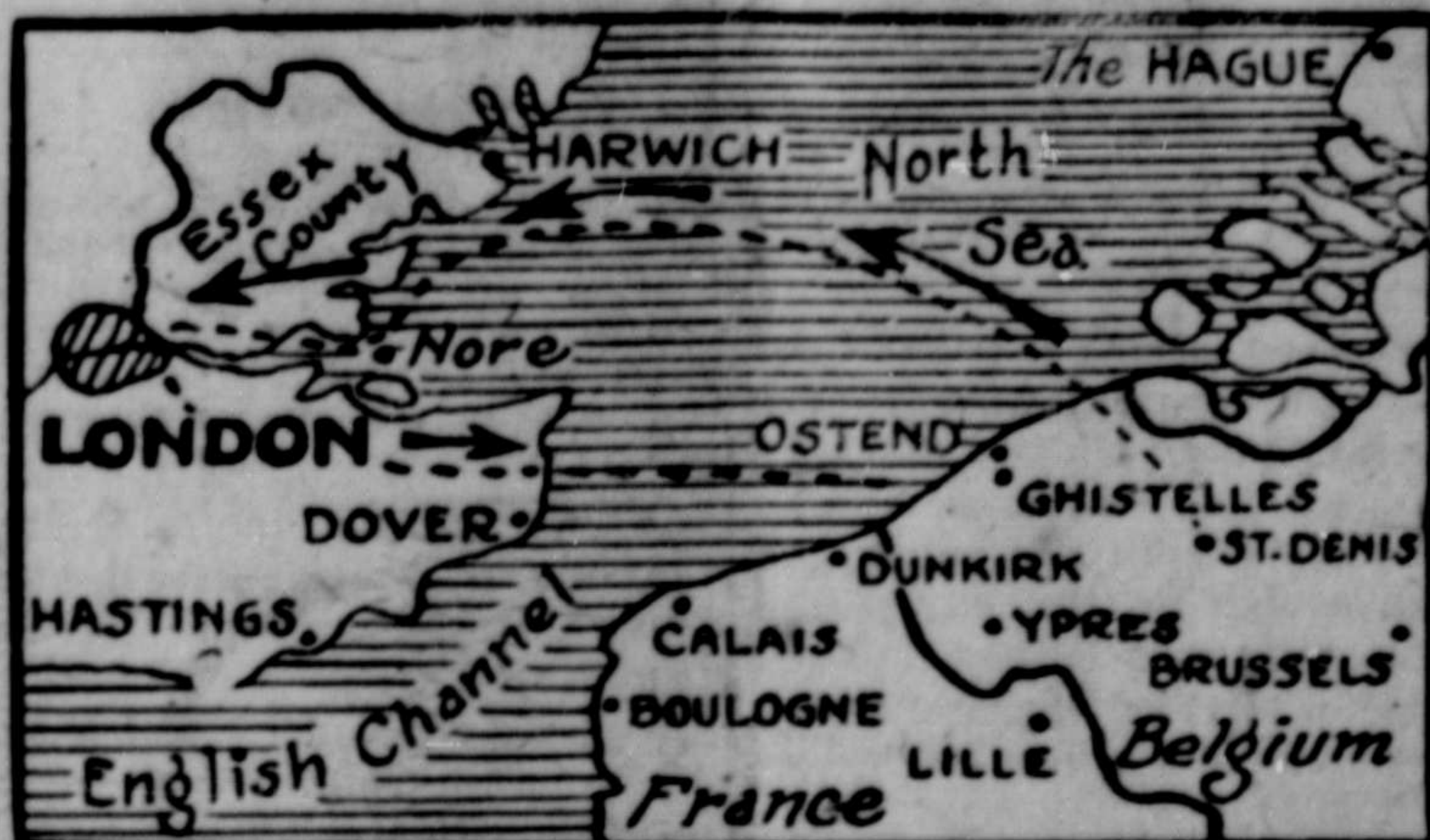
ROUTE TAKEN BY THE RAIDERS

NEW TELEPHONE DIRECTORY The City is about to publish a new Telephone Directory. Requests for alterations, additions or changes to same, will be received up to Friday evening, June 22, and must be in writing, addressed to the Superintendent of Utilities, City Hall.