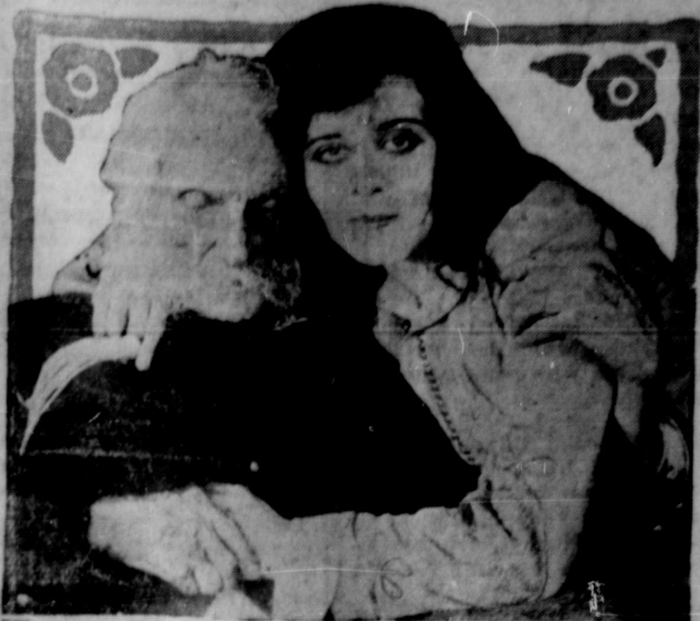
Scene from "Under Two Flags," showing at the Westholme tonight