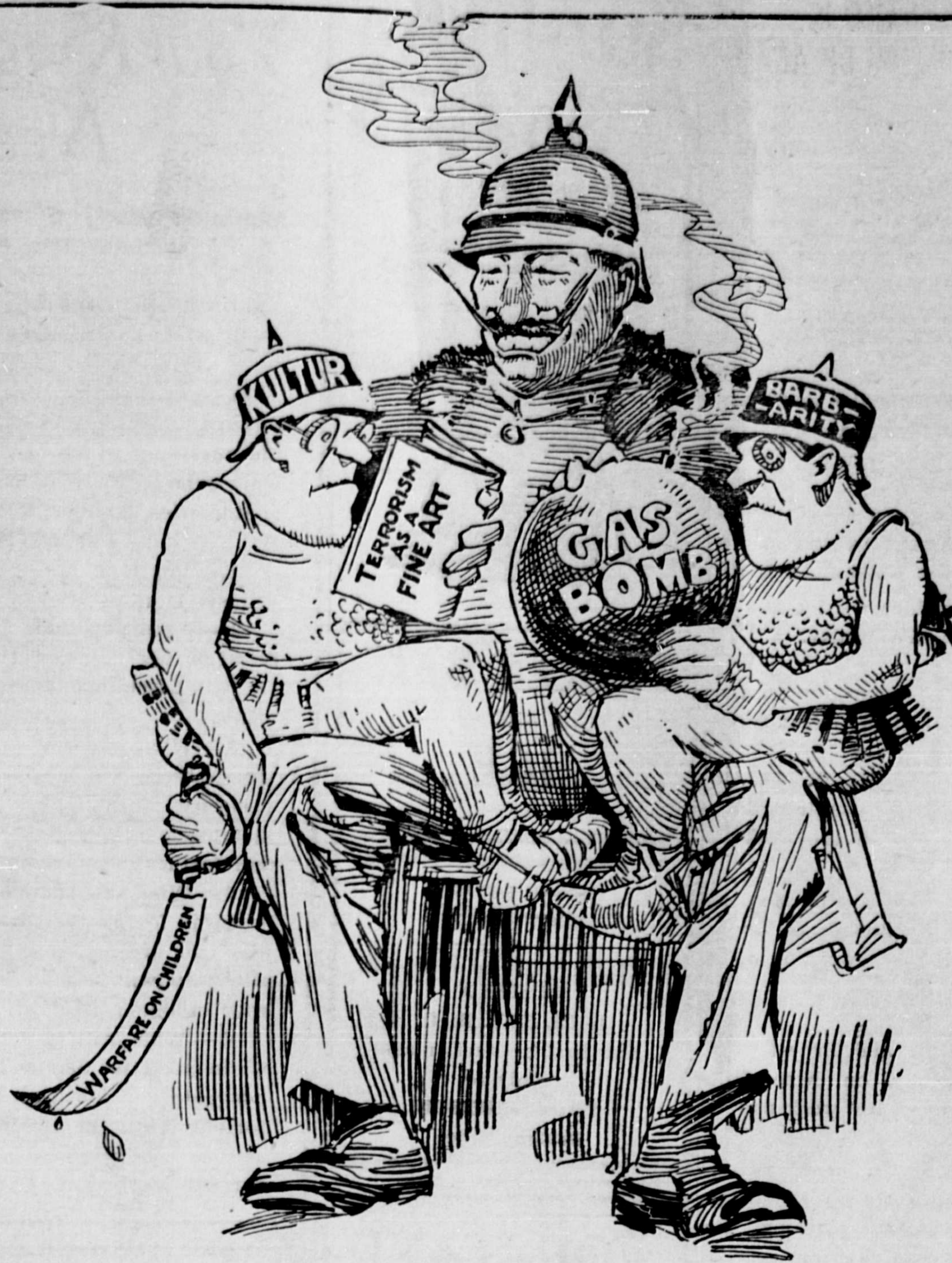
KAISER BILL—"It's easy to tell the little todgers apart. One years glasses and t'other plays with gases."

PRINCE RUPERT, B.C. Branch Yard at Smithers