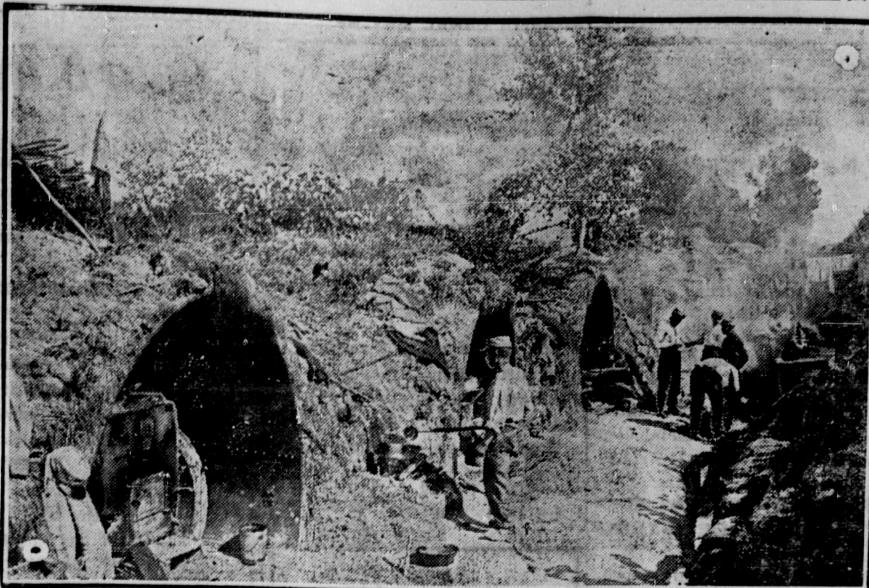
FRENCH INSTALL PORTABLE KITCHENS ALONG THE AISNE.—The portable kitchens shown are placed under bomb proof shelters made of rivetted sheet iron and faced with earth.

50c. a box, 6 for 2.50, trial size 25c. At dealers or sent postpaid on receipt of price by Fruit-a-tives Limited, Ottawa.