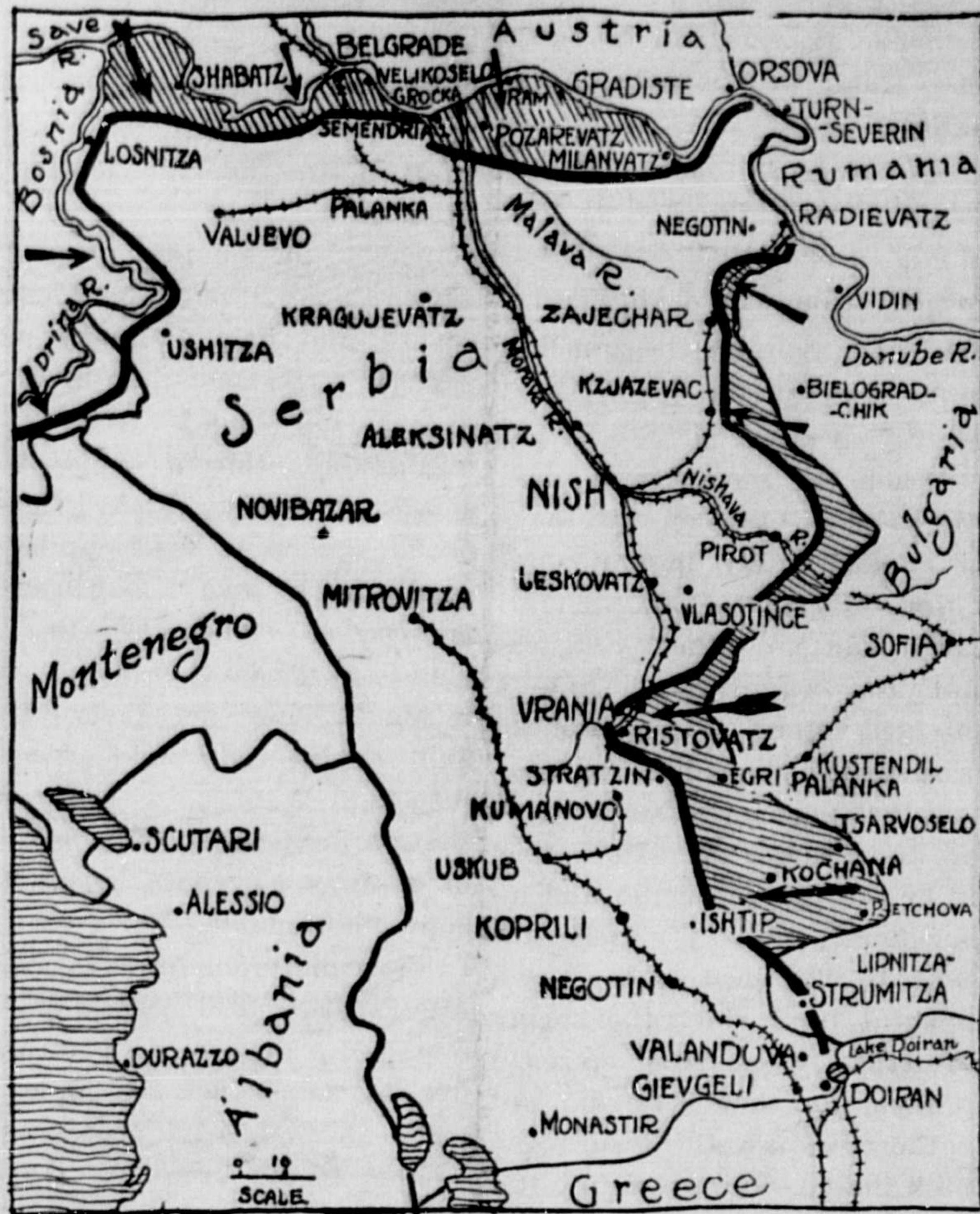
ALLIES RUSH TO AID SERBIA