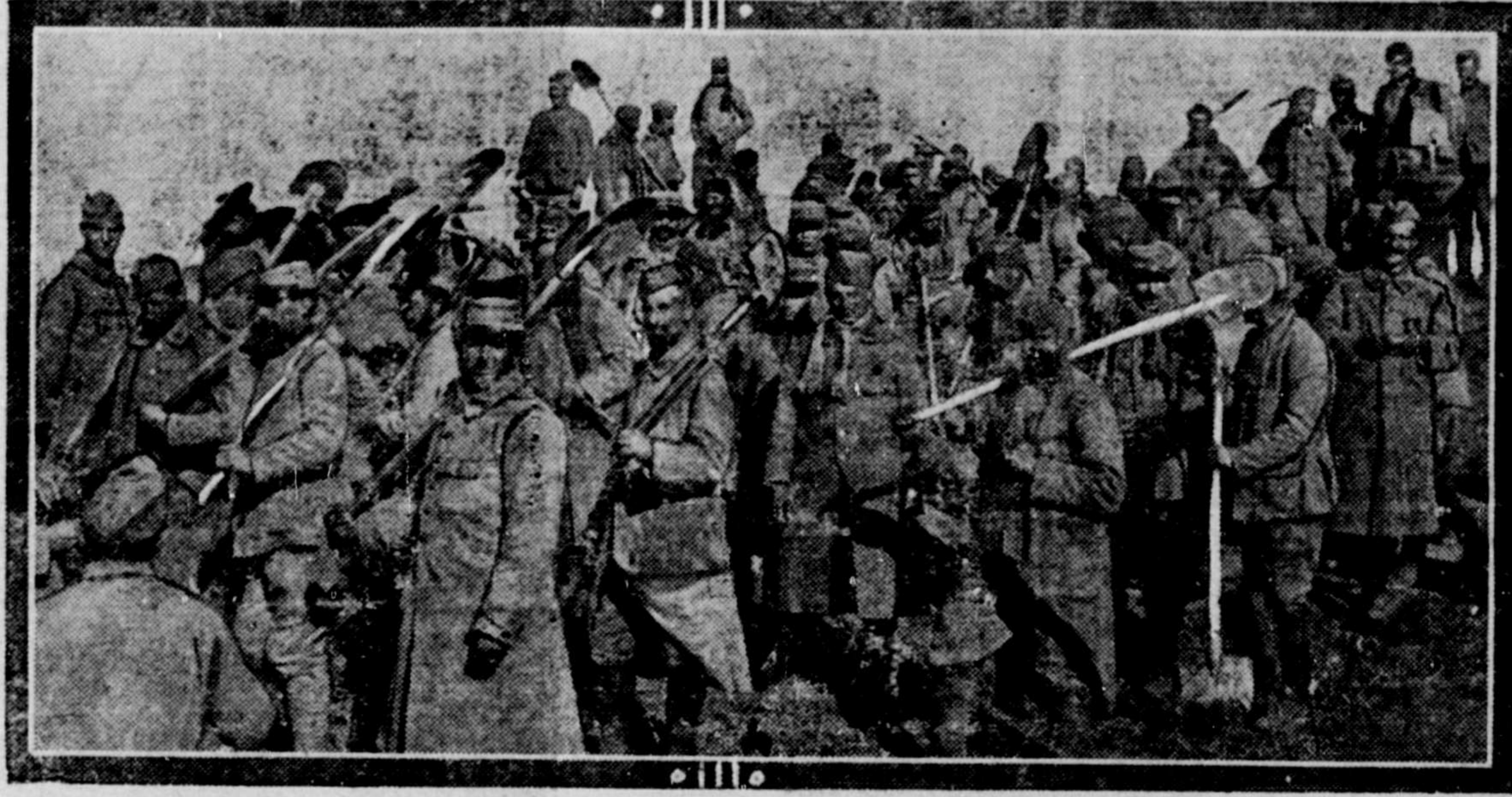
THE TRENCH DIGGERS AT SALONIKI.—A detail of sappers armed with their long-handled spades off to the outskirts of Saloniki to dig the trenches from which a possible attack directed by the Central Powers may be repulsed.