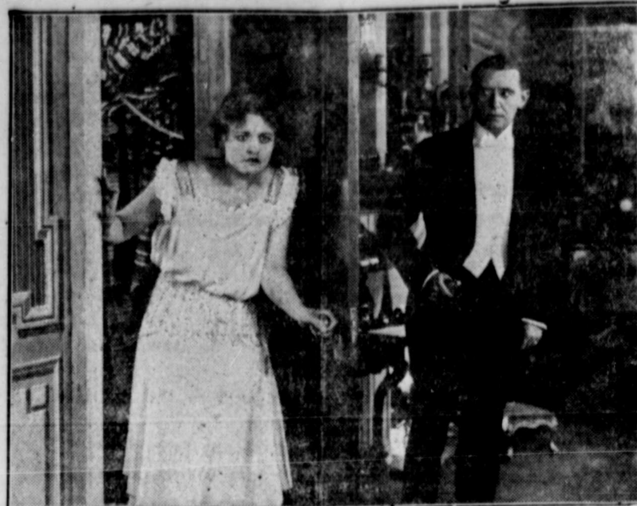
SCENE FROM "THE MUMMY AND THE HUMMING BIRD" AT THE MAJESTIC THEATRE TONIGHT