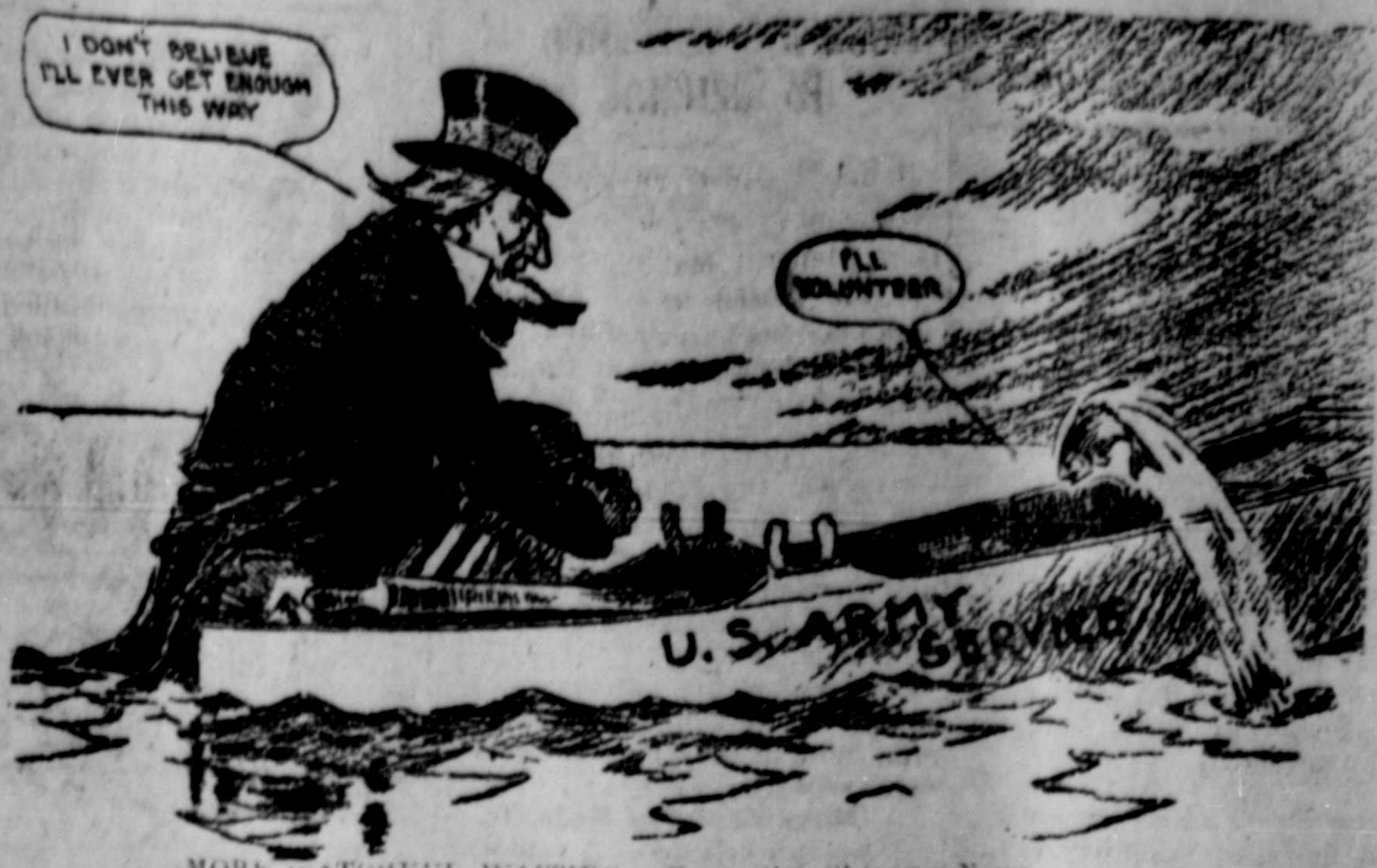
MORE WATCHFUL WAITING.—From the Chicago News.