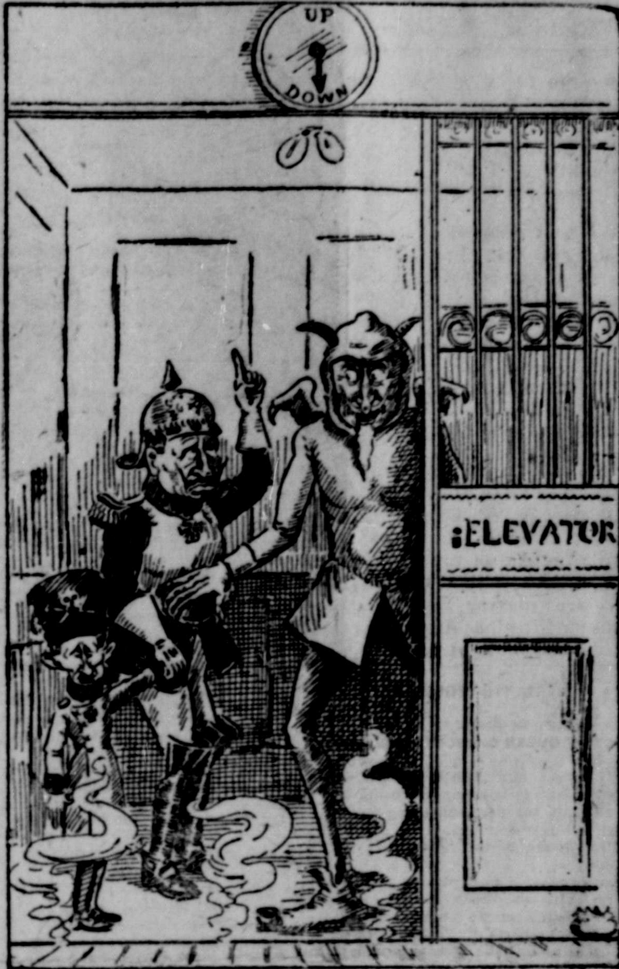
"DOWN" Operator: "Up? No. You two's going down."

The favorite household Coal is Ladyemith Wellington. Phone 15, Prince Rupert Coal Co.