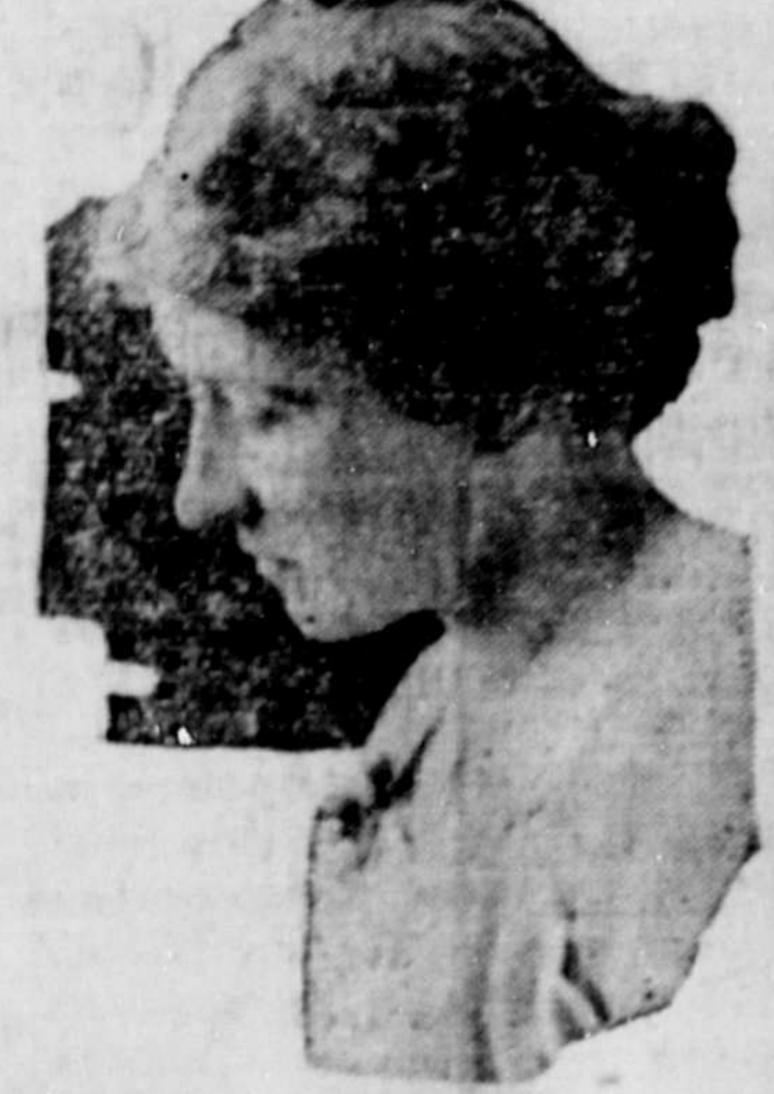
Wife of C. P. R. Vice-President Drowns.