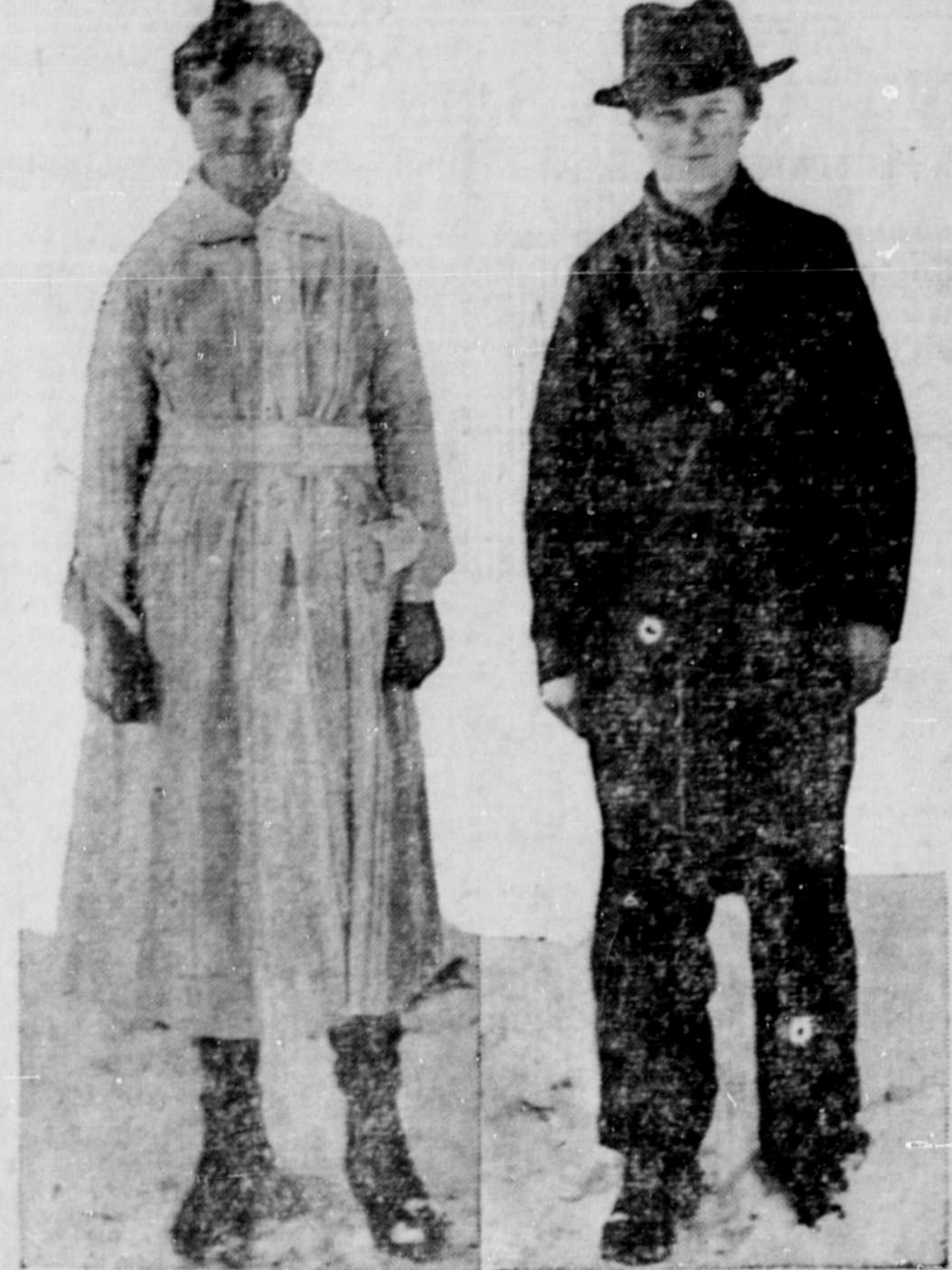
CHORE BOY DISCOVERS HE IS REALLY A GIRL.