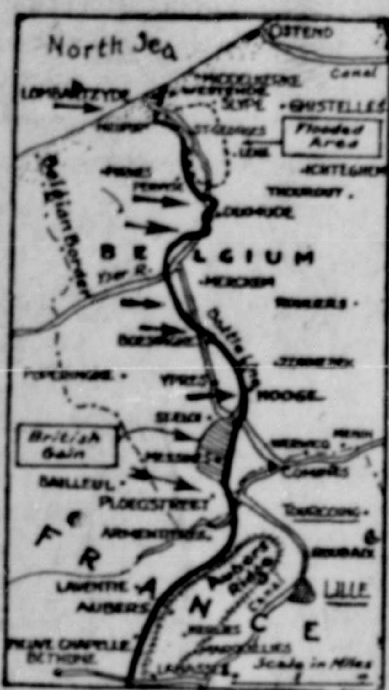
Situation South of Dixmude. On the map the battle line between La Basse Canal and the coast is shown. The recent British gains and the location of the Auber's ridge and the flooded area north of Dixmude also are indicated.